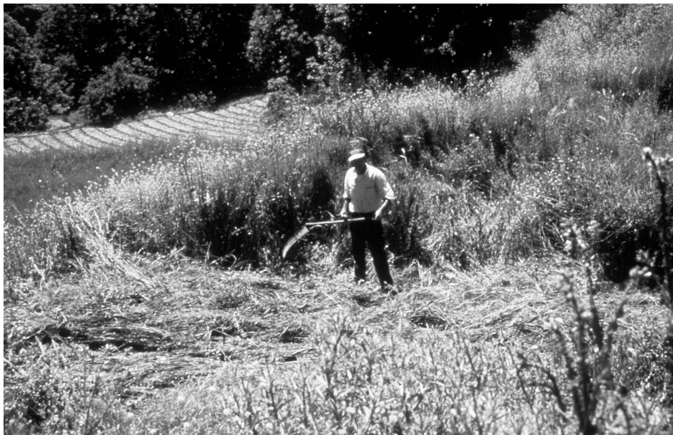
FIGURE 1 Because of the rough orography in the Sierra Nevada and the average age of the population working in the agricultural sector, innovation in the region is quite difficult.

heterogeneity that characterizes the different regions of the Sierra Nevada. This heterogeneity is manifested in the variety of natural resources and in the imbalance in funding for public infrastructure, as well as in the pronounced and faltering relief that characterizes this territory. It is also linked with the uneven population structure and the social, political, and economic stratification that this represents.