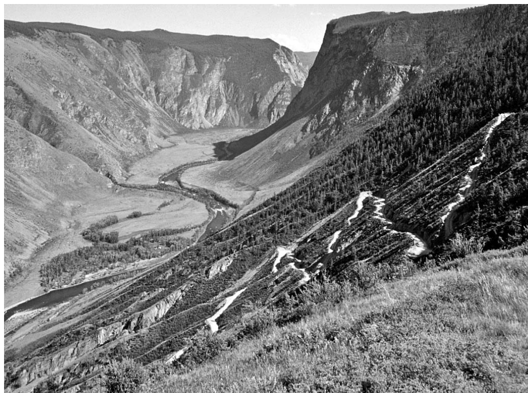
FIGURE 1 Chulyshman River Valley, showing a new road facilitating increased tourist access.

Dealing with the natural and social effects of the rapid growth of tourism, as well as the impending privatization of land, are the primary concerns of the Republic and local-level planning authorities. One of the strategies under development is the establishment of