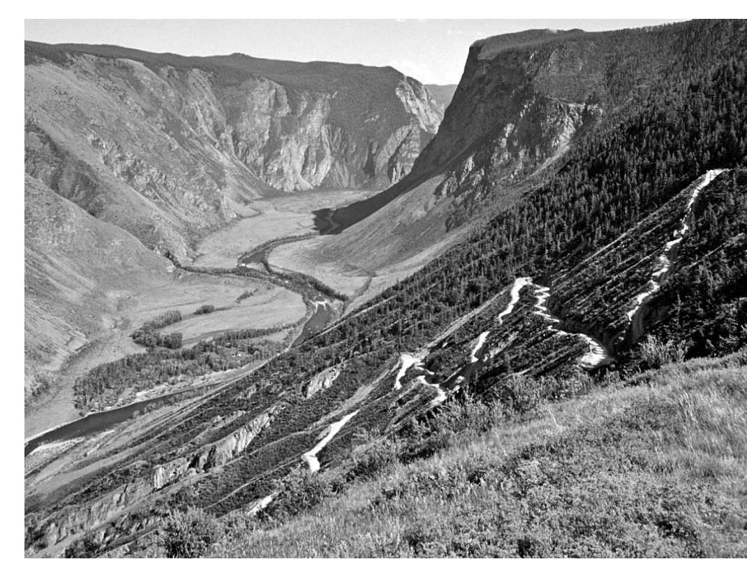
FIGURE 1 Chulyshman River Valley, showing a new road facilitating increased tourist access.

Dealing with the natural and social effects of the rapid growth of tourism, as well as the impending privatization of land, are the primary concerns of the Republic and local-level planning authorities. One of the strategies under development is the establishment of