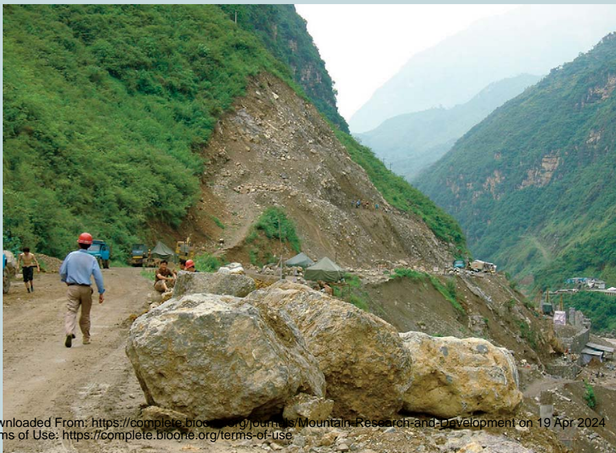
FIGURE 4 Environmental impacts of hydro-project road building in Zhaotong City.

land surface), steep slopes (nearly half the land has gradients higher than 25^\circ ), high precipitation (over 1000 mm), and widespread cultivation on sloping land (more than 70% of its farmland is on steep mountain slopes). This has induced serious soil erosion (Figure 3). More than half (52%) of the land surface suffers from soil loss, and 57% of the area affected has heavy (5000–8000 t/km 2 ) or moderate (2500–5000 t/km 2 ) degrees of soil erosion.