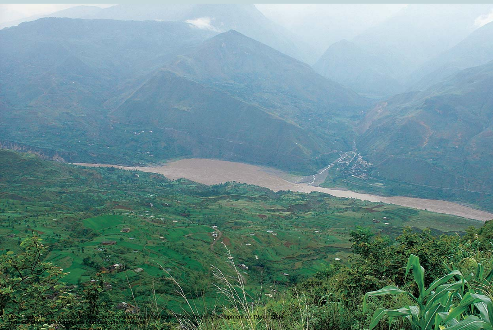
FIGURE 5 Resettlement of the rural population in areas such as this traditionally farmed landscape along the Jinsha River will cause social conflicts, especially as the local and district governments have little decision-making power vis-à-vis the state and the hydropower company. This calls for change at the policy level.

China issued exclusive regulations for the resettlement of people affected by the Three Gorges project, which effectively helped solve problems raised in