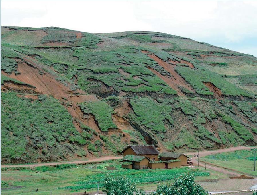
FIGURE 3 Slope farming and resulting erosion and land degradation processes in Dashabao, Zhaotong City.

ing national policy and the orders of higher administrative authorities. There is a saying in the local areas about the projects: “The country will get achievement, the enterprises will get benefits, the local government will get difficulties, and resettled migrants will get poverty.”