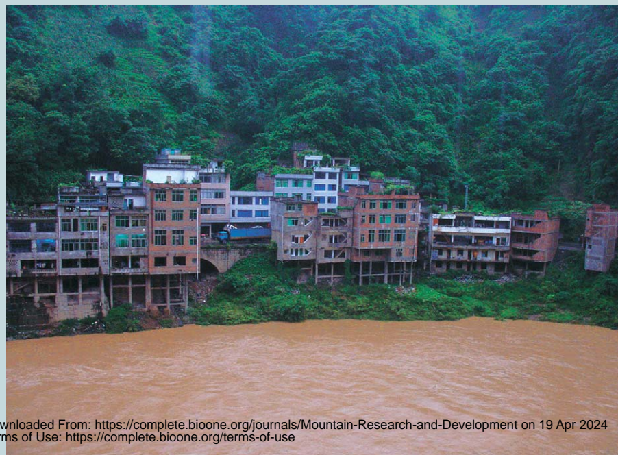
FIGURE 2 Buildings on concrete stilts show the extreme scarcity of flat land suitable for construction in the densely populated Zhaotong City area.

Theoretically, major investments due to hydropower projects should be a powerful driver in developing the local society and economy. Hydropower projects could provide local residents with clean energy, hopefully reducing forest logging, protecting the mountain ecosystem, and promoting the regional economy. Large water