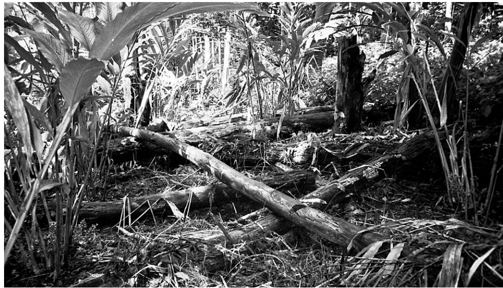
FIGURE 2 Cardamom cultivation in natural forest after selective thinning of tree canopy. East Usambaras, Tanzania.

difficult (Stocking and Perkin 1992; Hamunen 1998) (Figure 3).