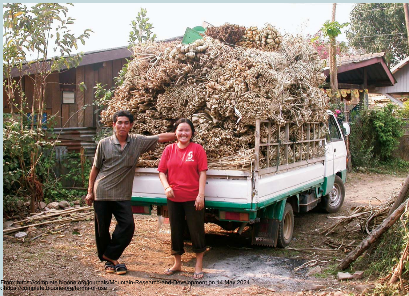
FIGURE 5 Selling collectives increase the scale of product sales and enable greater bargaining power—as is the case for paper mulberry ( Broussonetia papyrifera ) shown here.

To address these problems, the project put in place systems for training extension workers, improving storage systems, and introducing a simple market information system (MIS). The MIS was set up in 14 villages. Every 2 weeks, market prices and other information are collected for 14 products in these 14 villages. At the same time, the current prices for these products are obtained by fax from the agricultural office in Loei Province, Thailand, which is the main export destination. All this information is analyzed, summarized, and sent back within 2 days to all 14 villages, in the form of a poster that is displayed on a signboard in each village. This system is implemented by the district commerce officer and one project staff member. It