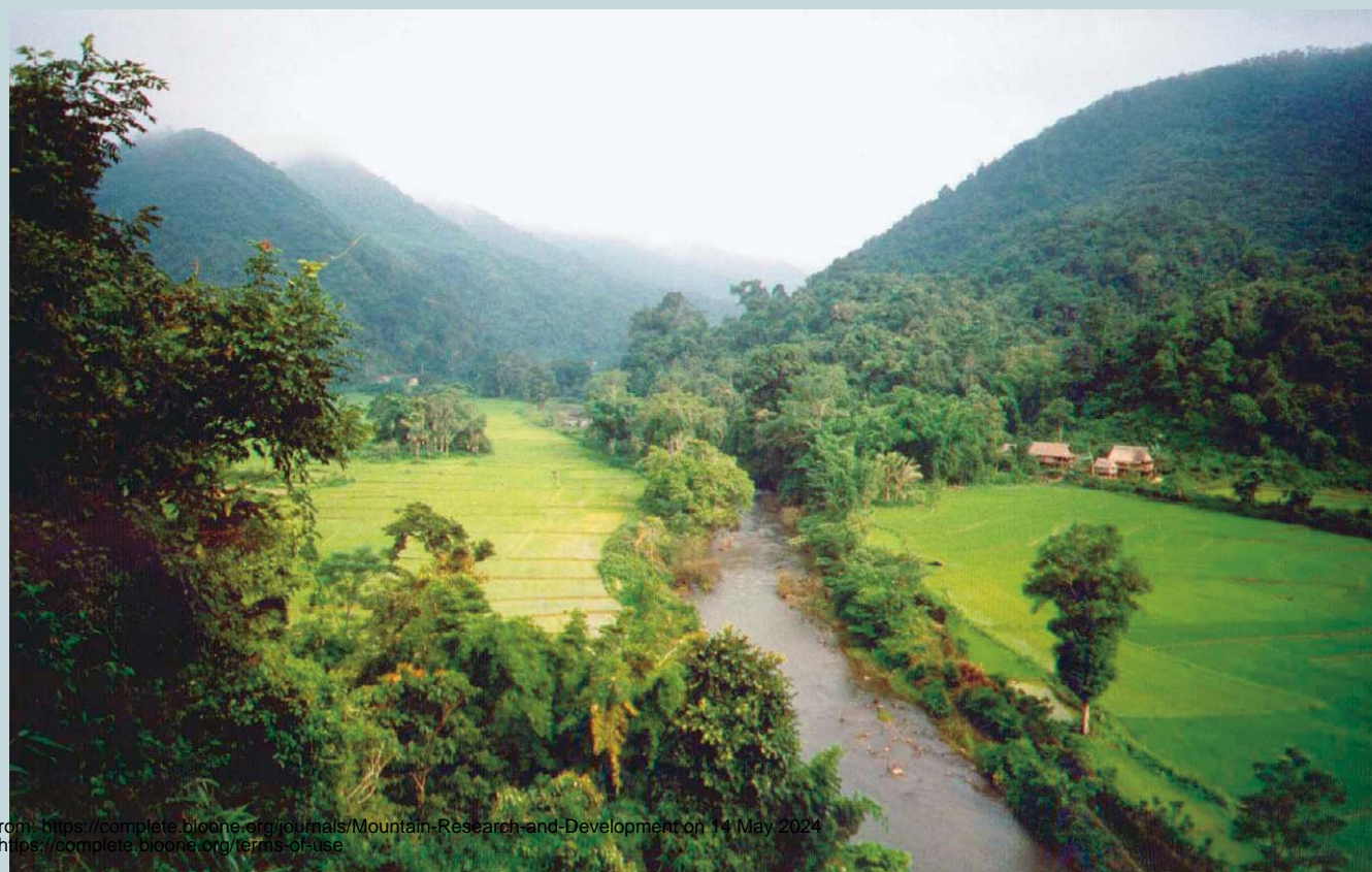
FIGURE 1 Typical forested landscape in northern Laos.

Despite these national measures, however, it is understood that information exchange has to begin with local networking, linking farmers to companies, map-