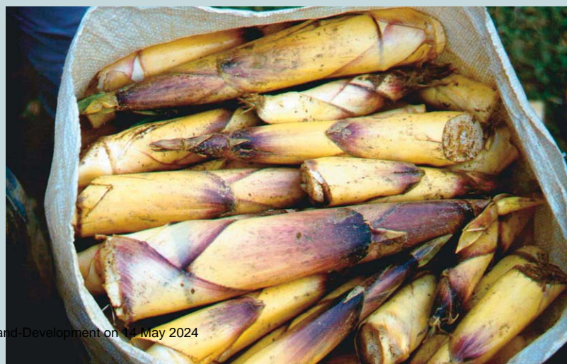
FIGURE 3 Bitter bamboo shoots ( Indosasa sinensis ).