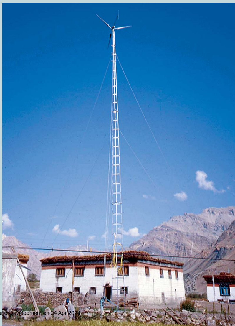
FIGURE 1 The pawan-chakki or windmill built by the Lossarpas.

Energy is neither explicitly recognized as a basic human need nor as a cause of poverty. Yet it is clear that efficient and uninterrupted supply of energy facilitates the forces of development, enables a better quality of life, and builds human capacity. Although efforts have been made to promote renewable energy (RE)