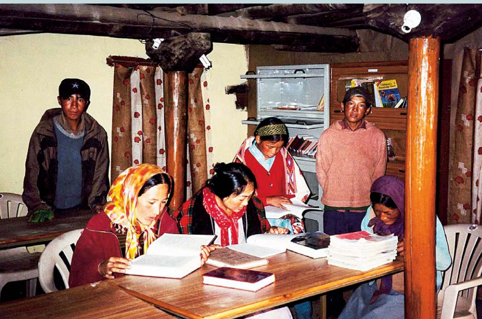
FIGURE 4 Adolescents at the Education Resource Center; both boys and girls can take advantage of the facility.

improving rural incomes. This can greatly improve the quality of life for mountain people, and for mountain women in particular.