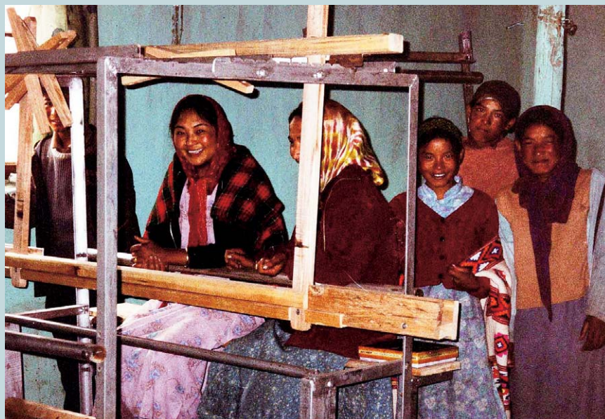
FIGURE 5 Women at the CEF-powered Community Work Station at Lossar.

The weaving center also doubles as a Community Utility Center and is helping to strengthen social ties through community meetings and celebration of festivals. The power generated when the common facilities are not in use is provided to a few households. This has greatly improved the quality of life for these households and also reduced their fuelwood use, in turn making women's lives much easier. The dark dreary winter scenario of complete isolation from the rest of the world has now changed for the Lossarpas, with regular supplies of electricity and access to satellite television and telephones, even during the winter months. The impact of this initiative in Lossar is thus not restricted to activities related to improving material conditions and rural amenities; it has had positive impacts on community relations, education, and other nonmaterial elements as well.