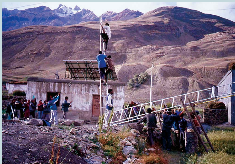
FIGURE 3 Villagers volunteering to set up the windmill in Lossar.

cal and cultural niches. Geographic proximity and commonality of resources and activities can give the cluster constituents the economic benefits of several positive externalities. Forward linkages with regional techno-economic networks can ensure product–market compatibility for these clusters and help them keep pace with ongoing development in the region while contributing to balanced regional growth. Cluster development in the Himalayas can be enabled by CEFs and facilitated to incorporate primary to secondary-level processing as well as suitable packaging and marketing. Area-specific produce such as medicinal plants and crafts can be developed as niche sector products. CEF-powered clusters can thus open up new livelihood avenues that involve less physical drudgery, while