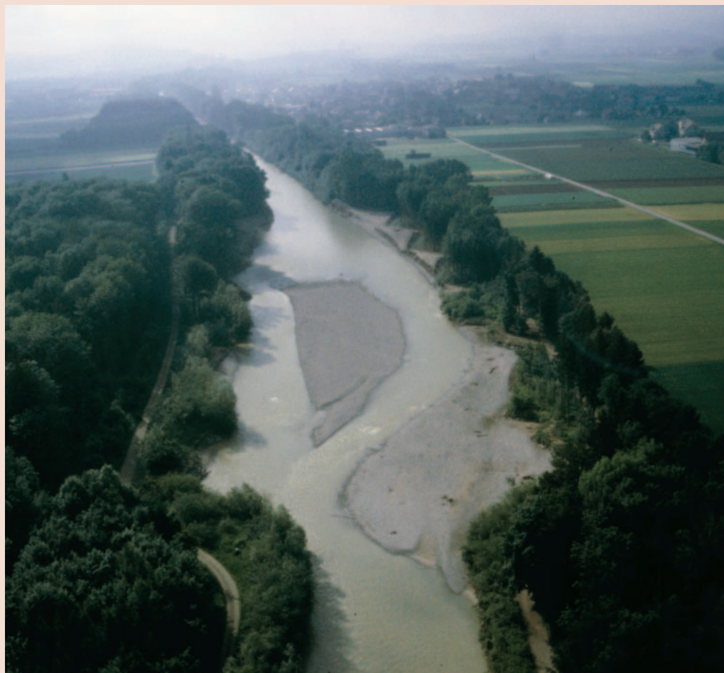
FIGURE 3 The result of a “Space for Rivers” initiative in Switzerland: the resilience of the Emme valley to flooding has been increased by allowing part of the Emme to return to its natural riverbed. This structural measure is cost-efficient, protects the river against undesired influx (thus improving water quality), helps conserve a natural ecosystem, and improves the quality of recreation areas. View of the Emme near Utzenstorf.

rather than certainties. Both the Netherlands and Switzerland offer good examples (“Space for Rivers” initiatives) of stakeholder-driven collaboration between society and scientists that is developing innovative approaches to flood hazards (Figure 3). Recognizing that engineered solutions cannot deliver full flood security, these programs allow experimentation with new policies and practices that increase society’s resilience to floods and