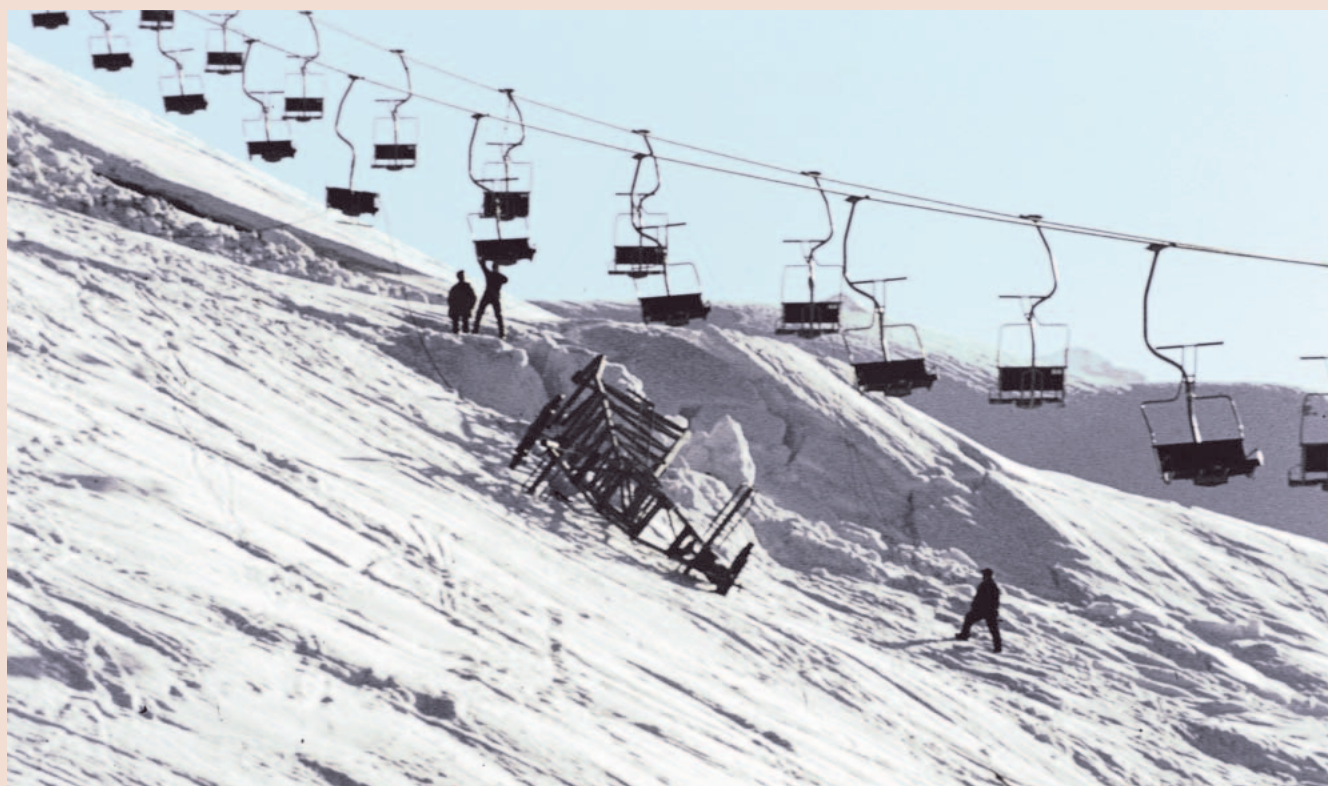
FIGURE 3 Chair lift pylon damaged by snow pressure on 14 March 1999, in Hasliberg (Canton of Berne, Switzerland).

loss to the tourist industry: in February 1999, 45% of the Swiss cable cars and ski lifts were out of operation for 7 days on average. This meant that most day trippers still stayed away, although access roads were actually open. Not only cable car companies but the rest of the tourist industry as well had to bear the financial costs of this situation.