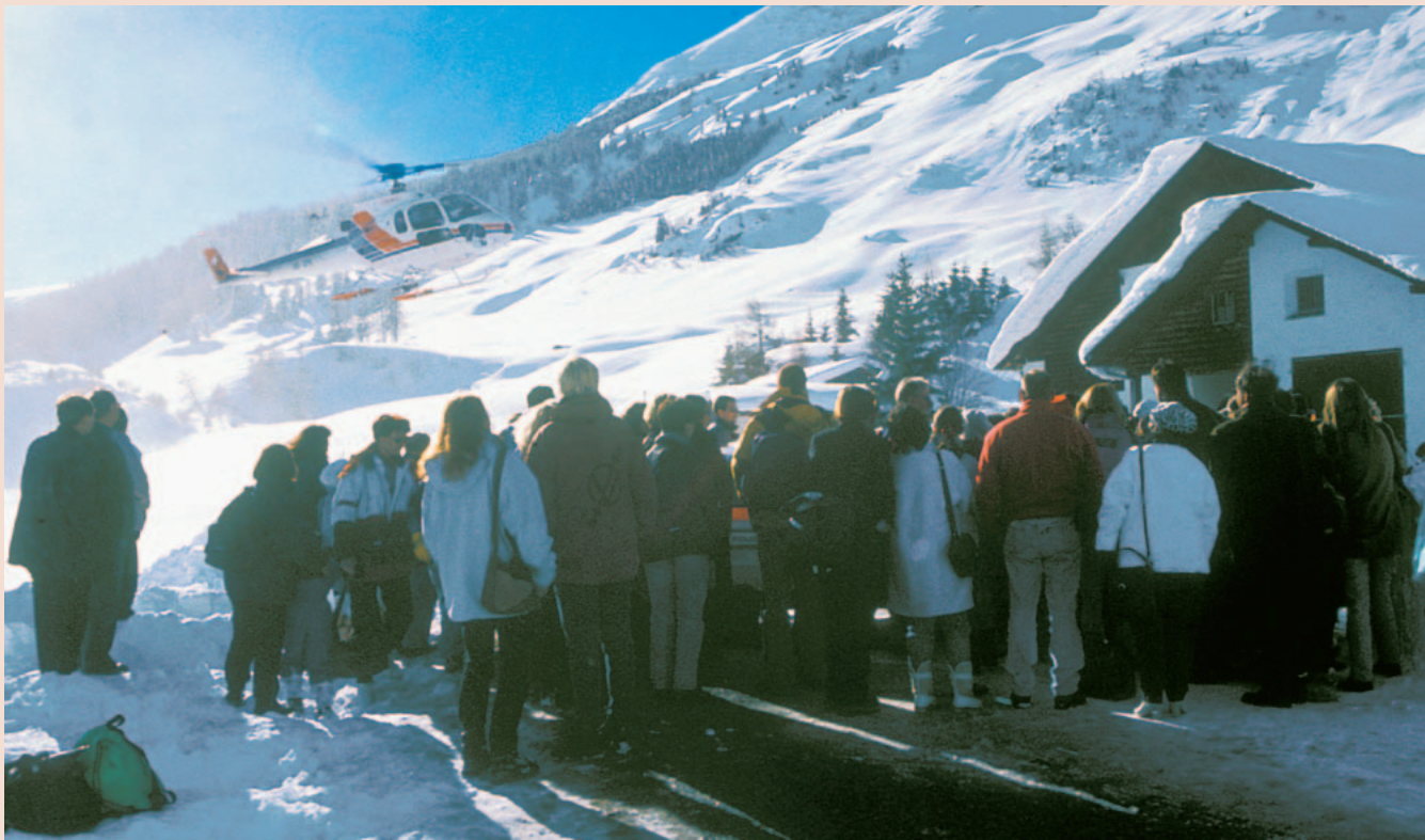
FIGURE 4 Tourists in Davos (Canton of Grisons, Switzerland) awaiting evacuation by air.

In conjunction with indirect loss, the biggest problems relate to reimbursement issues. Direct costs will usually be covered by insurance companies and public authorities. The companies and people affected are left with only comparably small sums to pay themselves. The opposite is the case with indirect costs. A case study on the avalanche winter of 1999 showed that over 90% of indirect costs had to be borne by the companies and people affected, as such costs are generally considered a personal risk, the tourist branch being no exception.