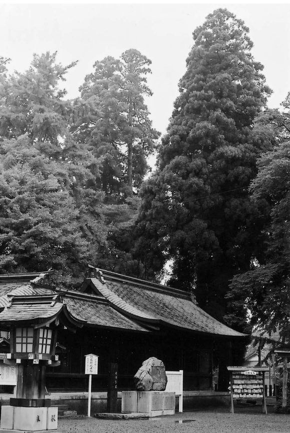
FIGURE 1 Ogatamanoki, Michelia compressa Sarg., at Aso-jingu shrine in Kumamoto prefecture, Japan.

ral environment, they should be protected and conserved as a heritage for citizens.