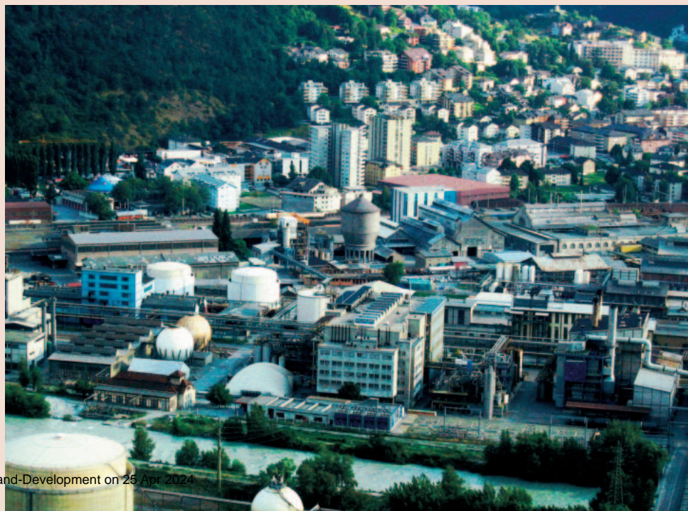
FIGURE 4 Visp, Switzerland. Industrial specialization and better access to major agglomerations also increase the outward orientation of small Alpine towns.

support for this role is justified. On the other hand, there is also an awareness that this role alone will not be sufficient to ensure the regional future. In other words: "Because our production systems are being continually renewed, professional qualifications are increasing and new opportunities are available to young people" ( network ), and "Local roots, identity, and quality of life still keep people in the