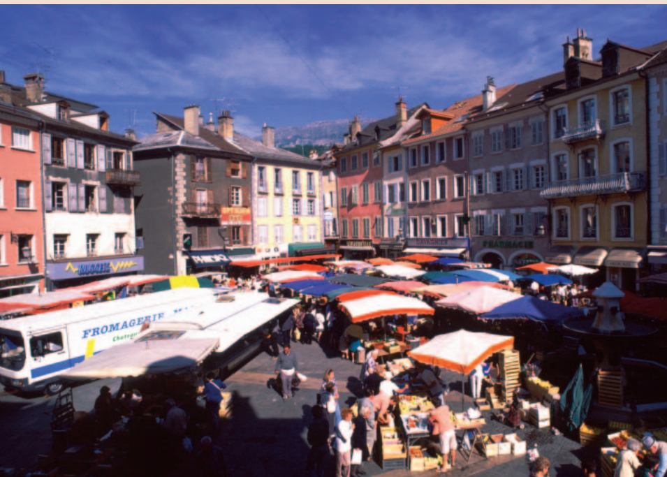
FIGURE 5 Gap, France. Given its dual function in serving the regional population as well as tourists, the local market in Gap offers high quality to both.

villages; our urban center supports this” ( supply ).