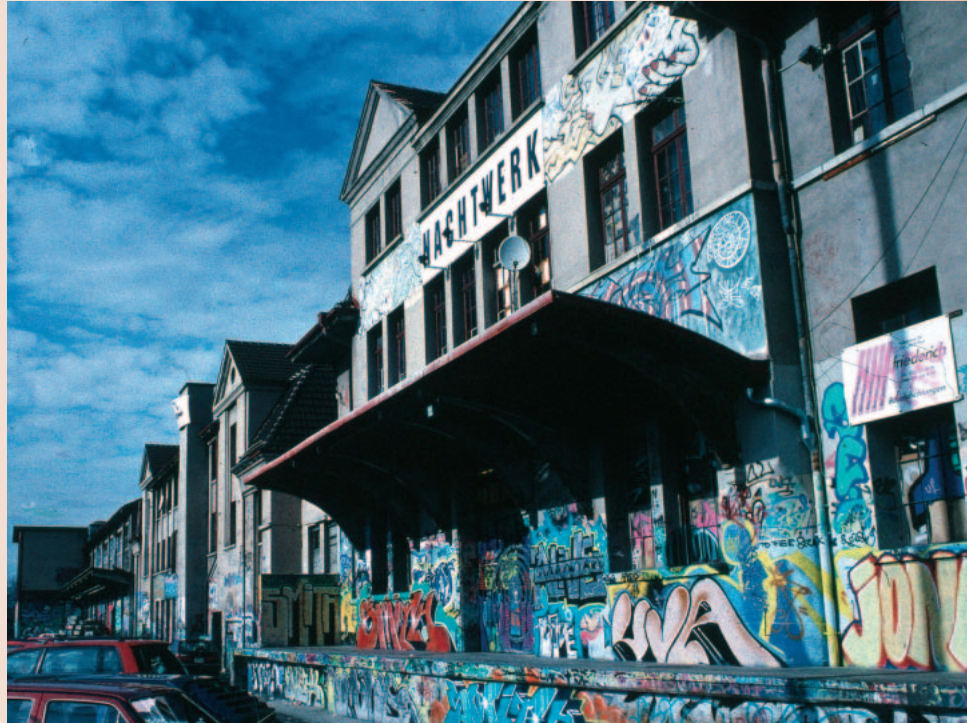
FIGURE 3 Thun, Switzerland. Informal (and later commercial) transformations of industrial blights into recreational and cultural areas have triggered supraregional ambitions.

support for this role is justified. On the other hand, there is also an awareness that this role alone will not be sufficient to ensure the regional future. In other words: "Because our production systems are being continually renewed, professional qualifications are increasing and new opportunities are available to young people" ( network ), and "Local roots, identity, and quality of life still keep people in the