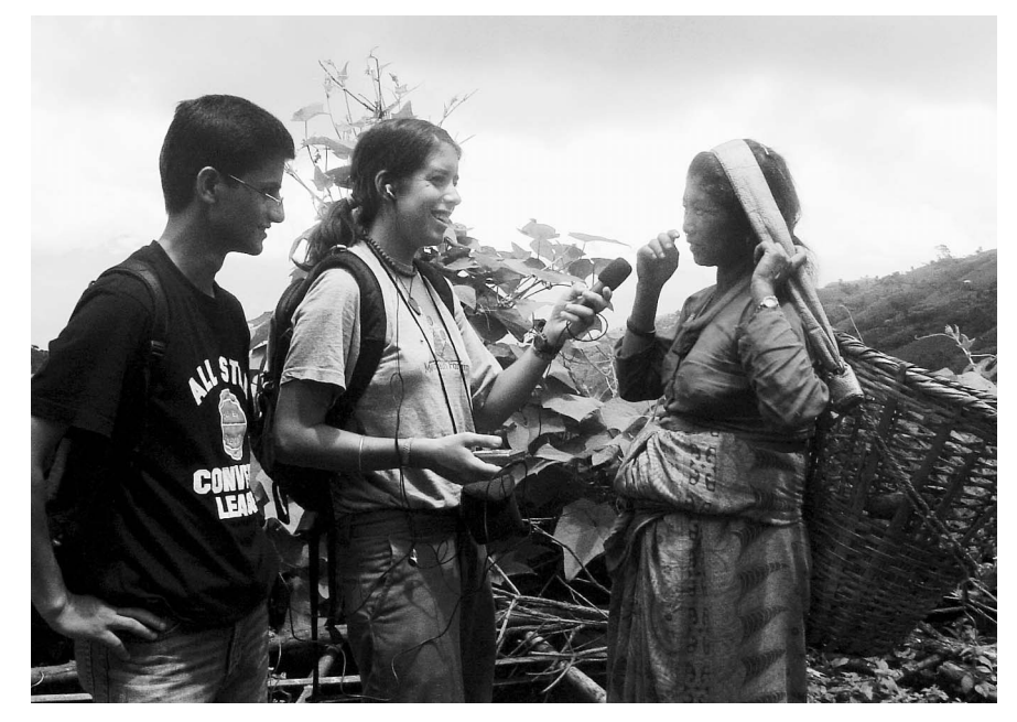
FIGURE 1 Interviewing a Tamang woman. Bhojeni, Kathmandu District, Nepal.

In the first phase, 8 such programs will be produced. As this is a pilot phase, the purpose is to assess whether such an approach—which