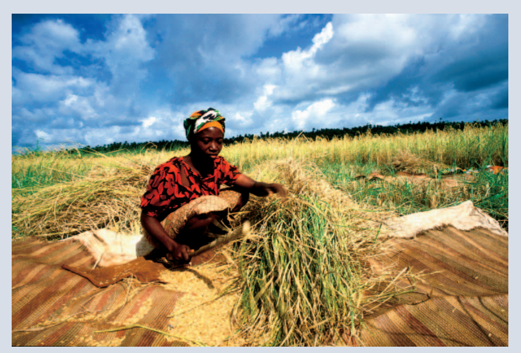
FIGURE 1 Young woman threshing rainfed rice.

Local knowledge about edible and cultivable fauna and flora, medicinal herbs, and shrubs has contributed tremendously to the development of current agricultural systems, both in terms of production techniques and in developing processing,