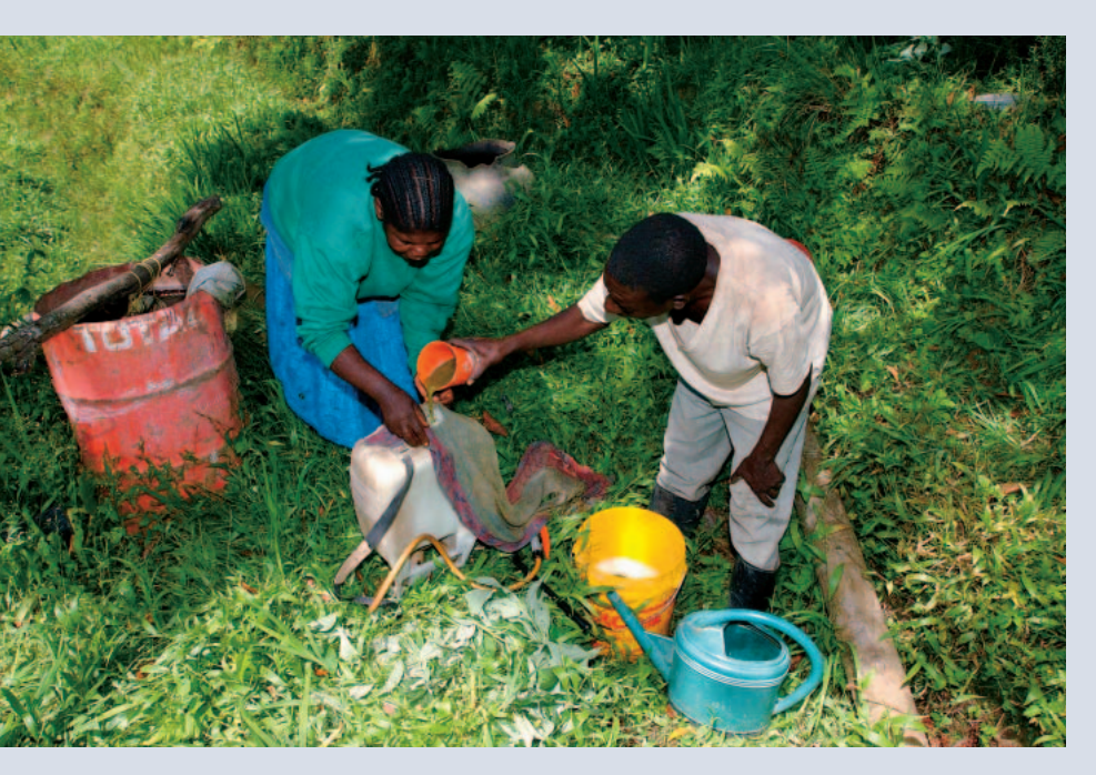
FIGURE 3 Farmers preparing a local pesticide from leaves and stems of selected plants to spray on vegetables in Mgeta village, Morogoro region, Tanzania.

eat the seeds that they planned to keep for the next planting season. However, without seed there will be no crop, and the cycle of seed recycling as well as closely related knowledge will be endangered. Other risk factors are outside influences on rural communities that lead to changed interests and attitudes on the part of the younger generation. The example of the disappearance of the castor oil crop from some of the Southern Highland villages highlights how fragile these systems are.