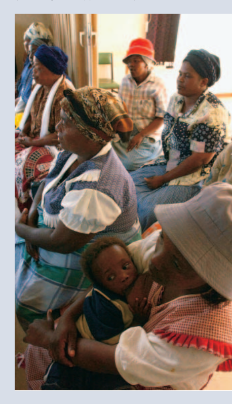
FIGURE 4 Women participating in a workshop discuss local seed varieties.

Due to workshops and intensive collaboration between many national partner institutions, an increasing interest in local knowledge was observed in Tanzania. Based on a stakeholder workshop, several institutions—the Commission for Science and Technology (COSTECH), the Tanzania Food and Nutrition Centre (TFNC), the National Environment Management Commission (NEMC), the University of Dar es Salaam, and the National Institute of Medical Research (NIMR)—formed a