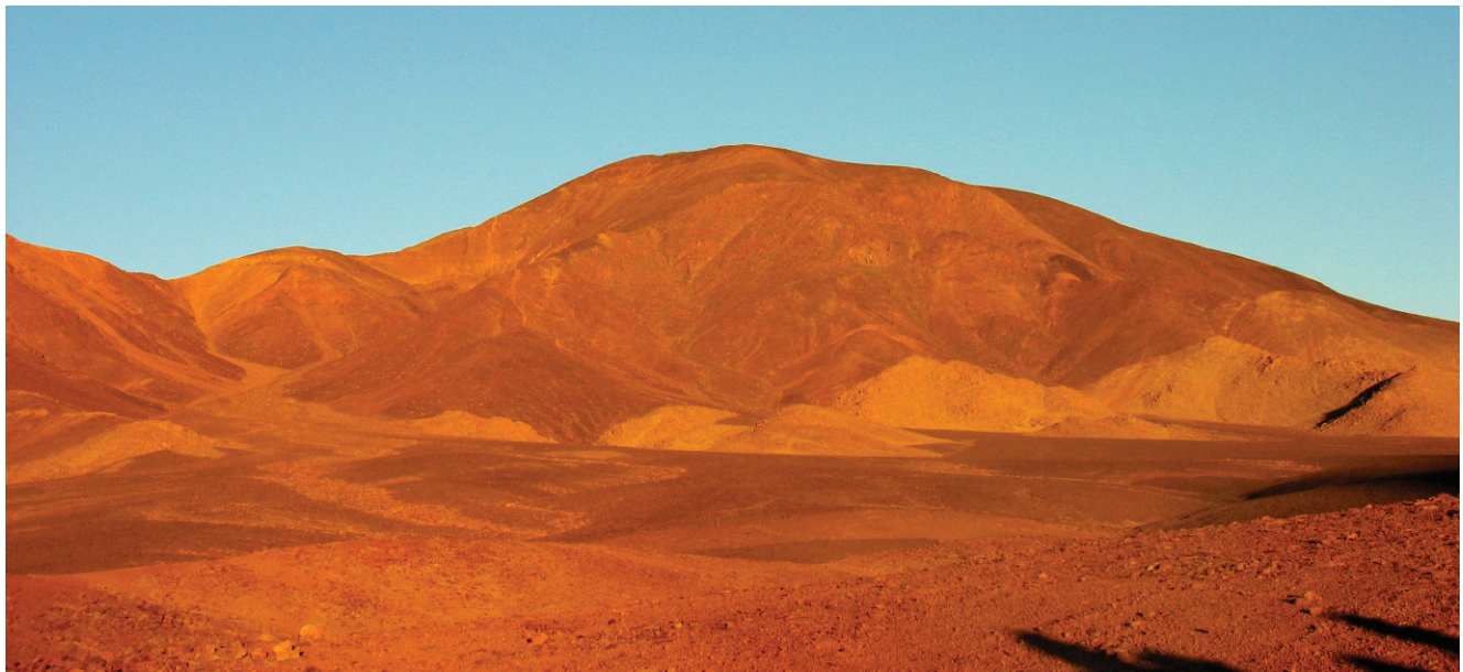
FIGURE 2 Mount Quimal, 4278 m high, seen from the base of the mountain. An old road can be used to go as far up as 3800 m in a 4-wheel drive vehicle. The mountain top can then be reached in a 2- to 3-hour hike. Cerro Quimal is so high that the presence of the mast or any other object on the mountain peak cannot be seen on the photo.

knife. But, installing an antenna on a sacred mountain, such as Mount Quimal, is particularly injurious and dangerous, because an external and nonnatural element inevitably disturbs the mountain, and this generates all sorts of material and spiritual disorders.