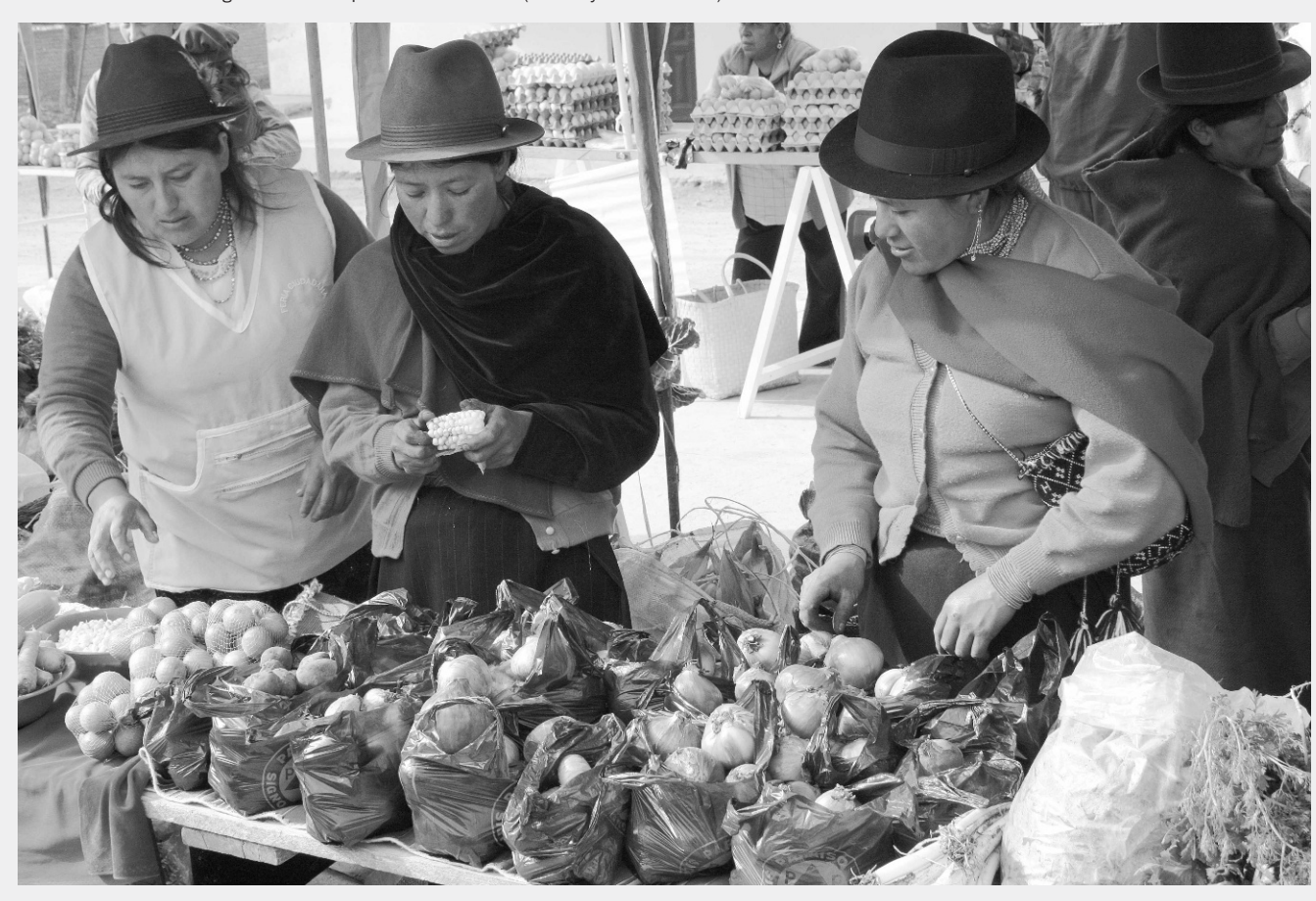
FIGURE 2 A market for organic mountain products in Ecuador.

strategies for their products (Figure 2). The Mountain Partnership Secretariat will promote the sharing of the results at national and regional level with a view to adapting and replicating these schemes in other Andean areas.