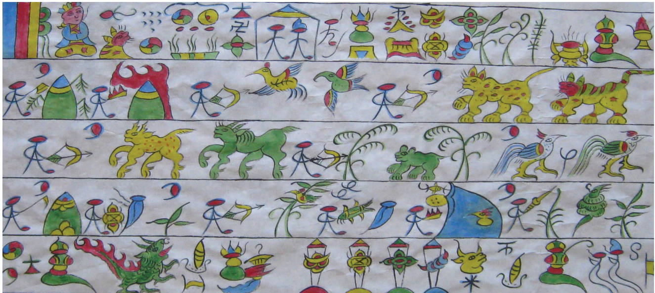
FIGURE 3 Contemporary pictograph script depicting environmental management through worship of the Nature God, created by a Dongba priest in Lijiang, China.

worship ceremony for the Nature God. The Dongba is illustrated on the upper left corner of the pictogram and chants,