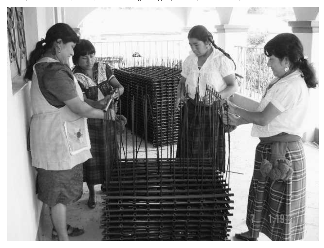
FIGURE 4 Women weaving the entrails of a community built and operated anaerobic wastewater treatment plant for recycling domestic effluents for further use for agricultural production on communal lands in a highland community in Ixtlán de Juárez, Sierra Norte, Oaxaca.