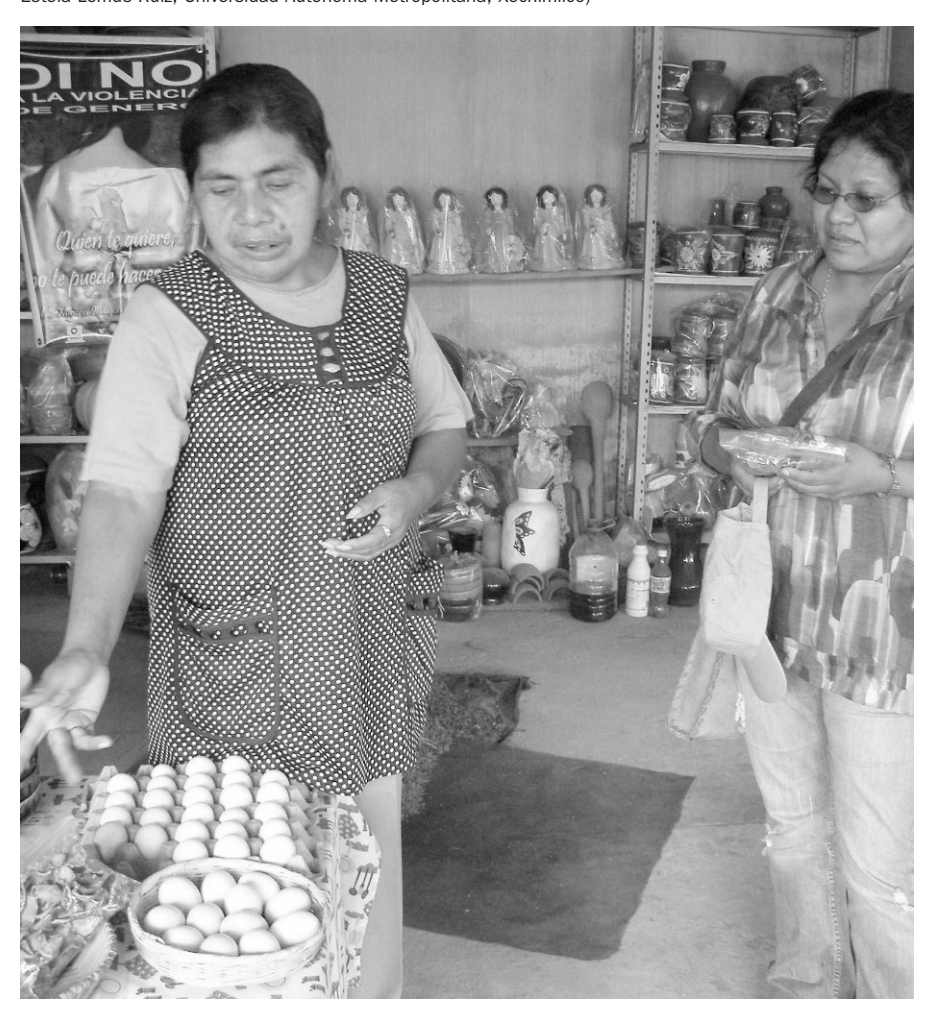
FIGURE 2 Community leaders involved in the search for new lines of production, providing new sources of employment and income based on the incorporation of local resources. In the photo the omega-3 eggs are featured along with handicrafts and a sign in the background pointing to a campaign against violence to women in which these women are active.

than that offered by the modernization discourse dominant in the North (Escobar 1995; Barkin 1998; Harris 2000; Toledo 2000). The more successful of these proposals are designed from the local point of view, where the inhabitants become the protagonists of the recovery and preservation of their resources.