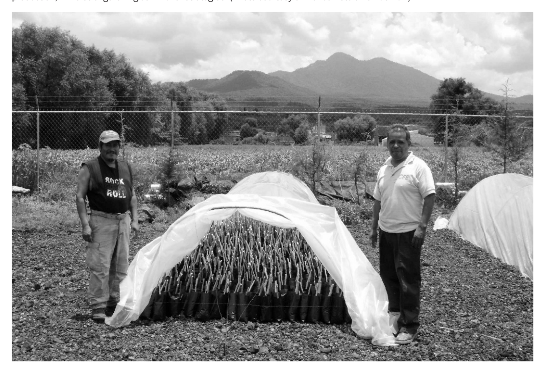
FIGURE 1 Mulberry tree seedlings: widely planted in highland Mexico in the 18 th century as food for silkworms and now being reintroduced in many indigenous communities as part of a collective effort to promote silk production for incorporation in handicrafts, and increasing value of artisan production, while strengthening communal strategies.

informed by the insights of Eric Wolf (1982), whose work demonstrated that adaptive behavior is characteristic of the most successful "traditional" communities (Barkin and Lemus-Ruiz 2011).