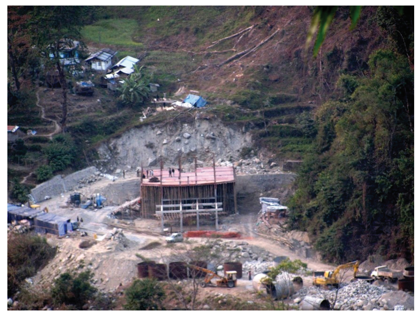
FIGURE 2 Site of a hydroelectricity project construction on former agricultural land in Sikkim. Remnants of agricultural terraces are visible around construction.

Many villagers said that the village forests they traditionally used for firewood and fodder collection were destroyed by construction work. Agricultural and forest land impacts were mostly temporary and could be reversed by applying suitable mitigation measures, as indicated in Table 1.