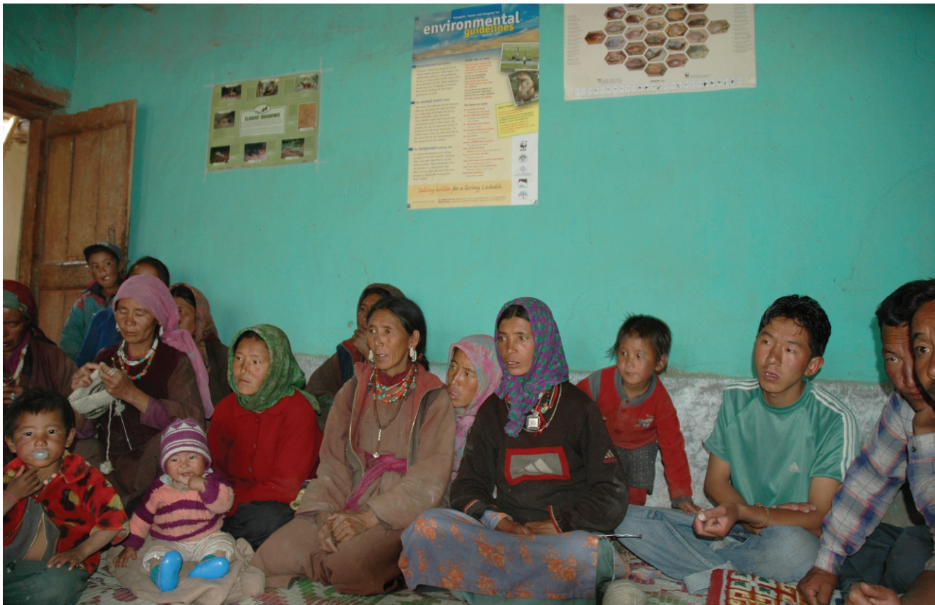
FIGURE 2 Local women receiving training in a homestay at Korzok.

to make these transitions. Understanding the gap in required skills, WWF-India facilitated a series of capacity-building exercises (Figure 2) for the Changpa community with homestay facilities. The resource persons were fellow Ladakhis who had experience with running successful homestays near the Hemis National Park. The capacity-building exercise included hands-on experience with a wide range of subjects such as hygiene, waste segregation, developing marketing strategies, handling finance, and drawing up and finalizing guidelines for tourists. Selected youths from the village were trained as wildlife guides, and financial assistance was provided to the women's self-help group to start a parachute café in the village. The training programs stressed the close and clear link between ecological conservation of the area and the livelihood sustenance of the villagers.