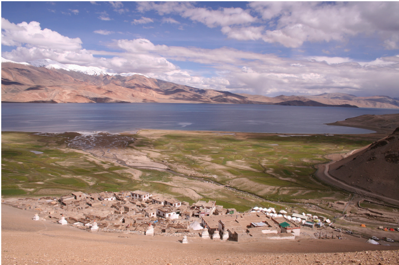
FIGURE 1 Korzok Village with Lake Tsomoriri and the designated tourist camps in the background.

The central development issue in Korzok was to create conditions for an enabling environment that would reconcile the needs of generating alternate livelihood opportunities and high-altitude wetland conservation to support the local economy and reduce poverty through a socially inclusive green tourism project. The main development issue, the evolution of the initiative, and some of the early impacts of the project constitute the focus of the present article. The case of Korzok is unique