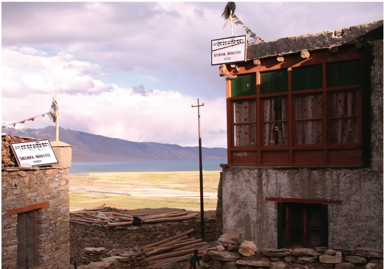
FIGURE 3 Typical homestays named after local birds.