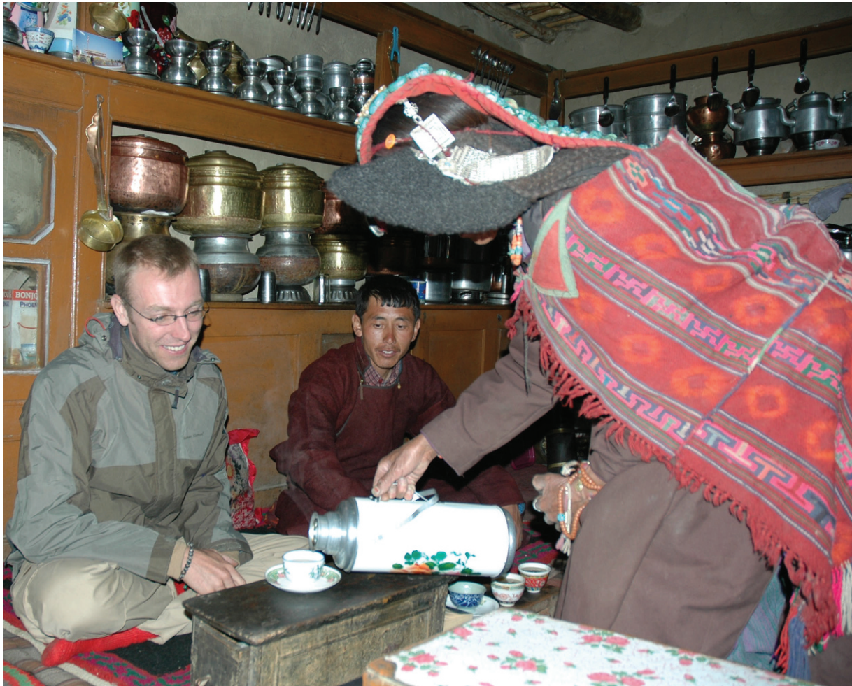
FIGURE 5 Guests enjoying traditional butter tea at a homestay.

spend on. Although some have invested in their children's education, others have purchased consumer goods. The Changpa households that live in tents in and around the Korzok settlement are also not benefitting economically from the homestay initiative, unlike their counterparts who live in permanent dwellings. Even if the seminomadic Changpas decide to join the homestay venture, it will invariably increase pressure on the ecosystem as well as competition. The TCT will need to evaluate and assess the optimal number of tourists the area can support in the future. Efforts such as banning trekking and camping in the grazing land in the surrounding areas have been undertaken to minimize impacts, but the rapidly growing tourism industry will continue to exert pressure on this fragile ecosystem. This calls for an evolving strategy for addressing future concerns. There also is a need to integrate traditional and spiritual belief systems with sustainable practices that have had documented impact on restoring habitats. For instance, Changpas depend on Tibetan astrological predictions recommended by monks for herd movements to different pastures (Namgail et al