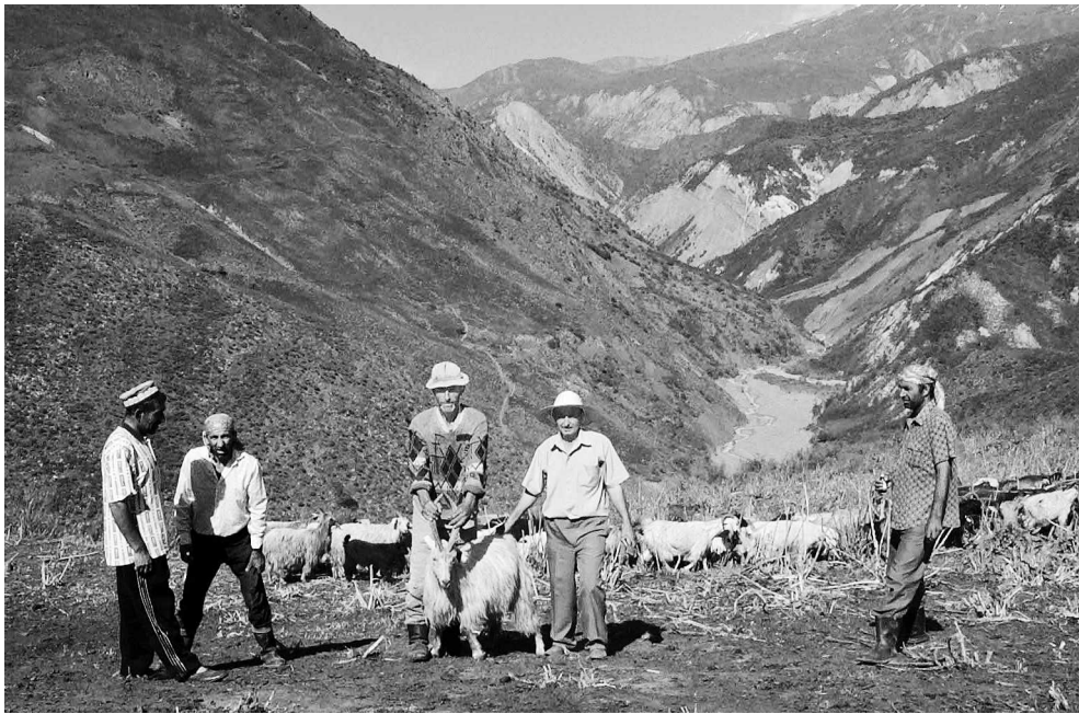
FIGURE 1 Hired shepherds in summer pastures, Surkhob valley, Tajikistan.

worsened this winter feed scarcity (Fitzherbert 2000). The inefficient processing and storage of hay also aggravates the winter feed scarcity (Figure 2), with estimates that this leads to a loss of energy and nutrients of up to 40% (World Bank 2007).