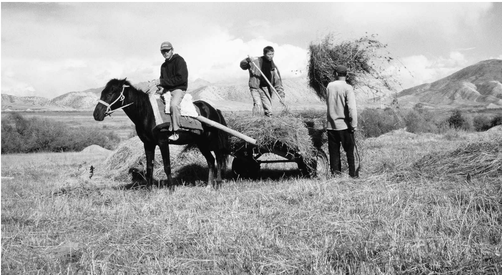
FIGURE 2 Hay harvesting, Naryn, Kyrgyzstan.

through overgrazing. However, no field research has been conducted in this region to test the impacts on pastureland of the rising goat numbers versus sheep and cattle.