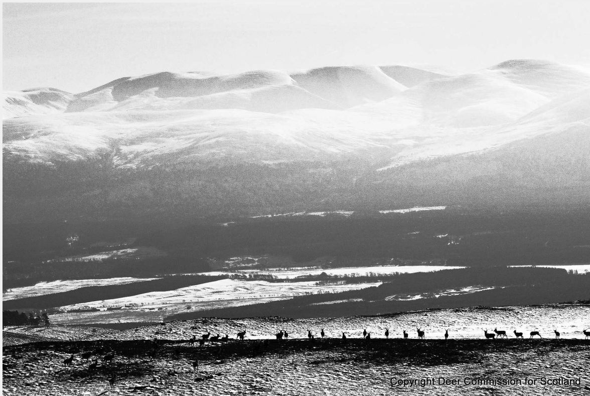
FIGURE 1 Red deer on Alvie Estate in the Cairngorms.

These efforts have led to the development of detailed maps of a continuum of wildness in the 2 national parks in conjunction with the on-going delineation of core areas of wild land and development of planning guidance. More recently, Scottish Natural Heritage has used this methodology to develop maps of wildness for Scotland as a whole. These were completed in 2012 and represent a landmark, with Scotland leading the way in producing Europe's most accurate and detailed maps of wildness.