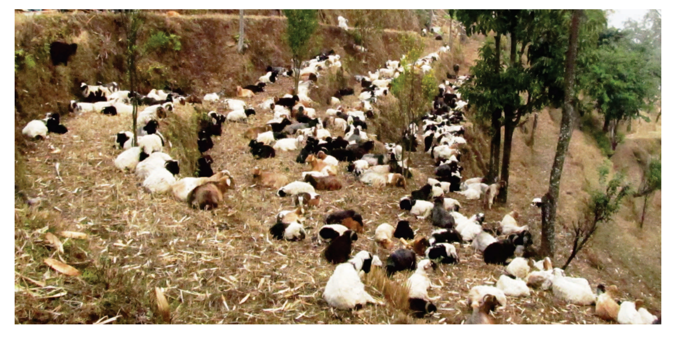
FIGURE 2 A sheep and goat herd on the way to winter pastures.

direct and indirect contributions. The major contribution was cash income from the sale of livestock. As reported by interviewees, each herd owner sells about 15–25 livestock per year (about 7% of the total). This generates a total of about 3 million NRs ( \approx US$ 35,000) for the 14 goths in the research area in Ghermu VDC, or an average gross annual income of about US$ 2500 per herder. The indirect contributions reported by informants included provision of manure for farmlands, employment, as well as cultural values, as explained by a herder interviewee: "Sheep have a cultural and spiritual value in the Gurung community, and we need sheep in most of our religious and cultural functions."