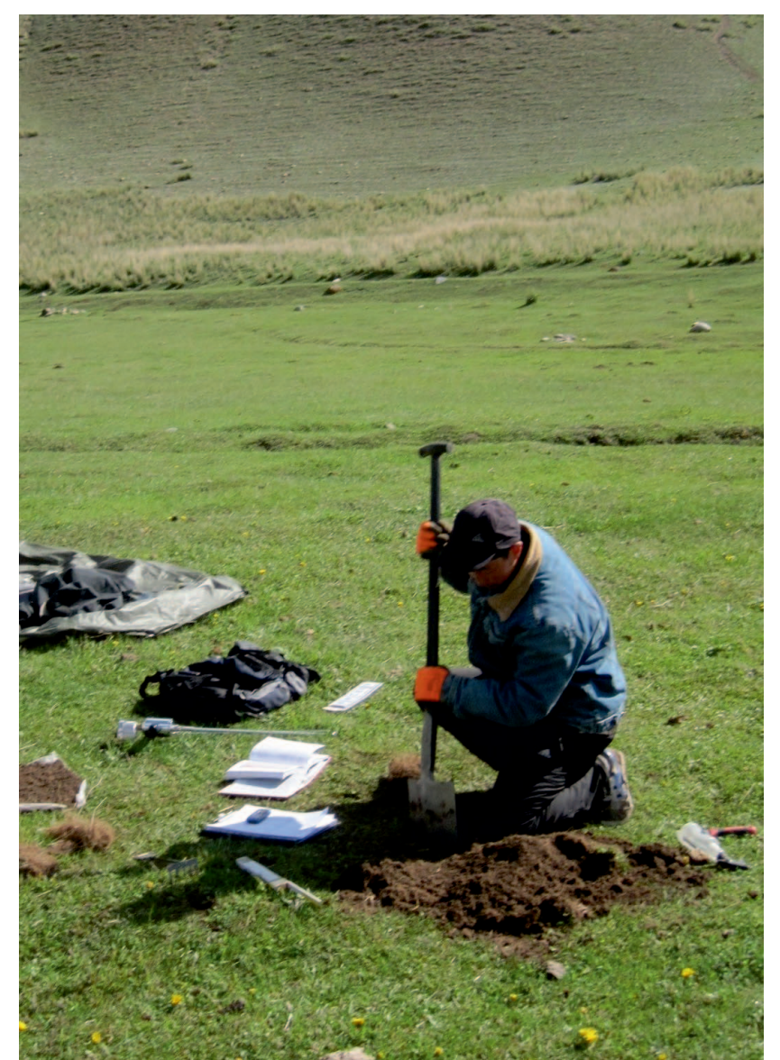
FIGURE 2 Application and verification of the VSA method in the field by Sabir Koshkonbaev (PhD student and colleague), Naryn Oblast, Kyrgyz Republic. (Photo by Peter Kirch, May 2013)

pressure on the winter and spring-autumn pastures. In contrast, the pressure on summer pastures is low.