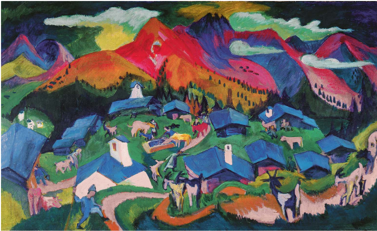
FIGURE 2 Return of the Animals by Ludwig Kirchner (1919).

scapes. On the other hand, they also discredit stereotypical notions and renew our view of landscapes. The introduction of perspective to painting in the 15th century, for instance, or the invention of photography and the artistic revolution represented by expressionism (see for example Ludwig Kirchner's Return of the Animals ; Figure 2) and abstraction shook up conceptions of landscape. Hence, landscape became a carrier of identity, and especially of national identity in modern Europe (Walter 2004), particularly in Switzerland.