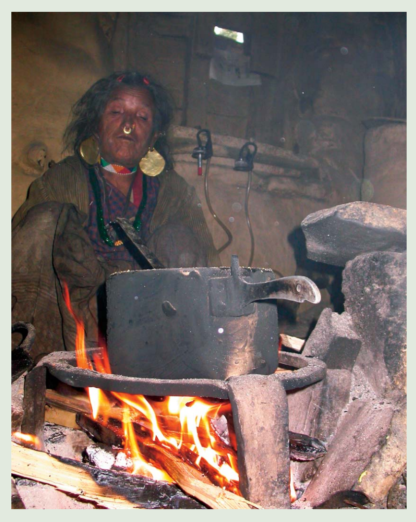
FIGURE 2 Indoor air pollution in a typical Humli home.

Traditional fuel (biomass) consumption in Nepal represents 93% of total energy use nationwide, and constitutes 100% of energy use in remote mountain areas such as Humla. This means that households in our project area devote up to 40 hours per week to collecting firewood (Figure 3). When they are not collecting firewood, vil-