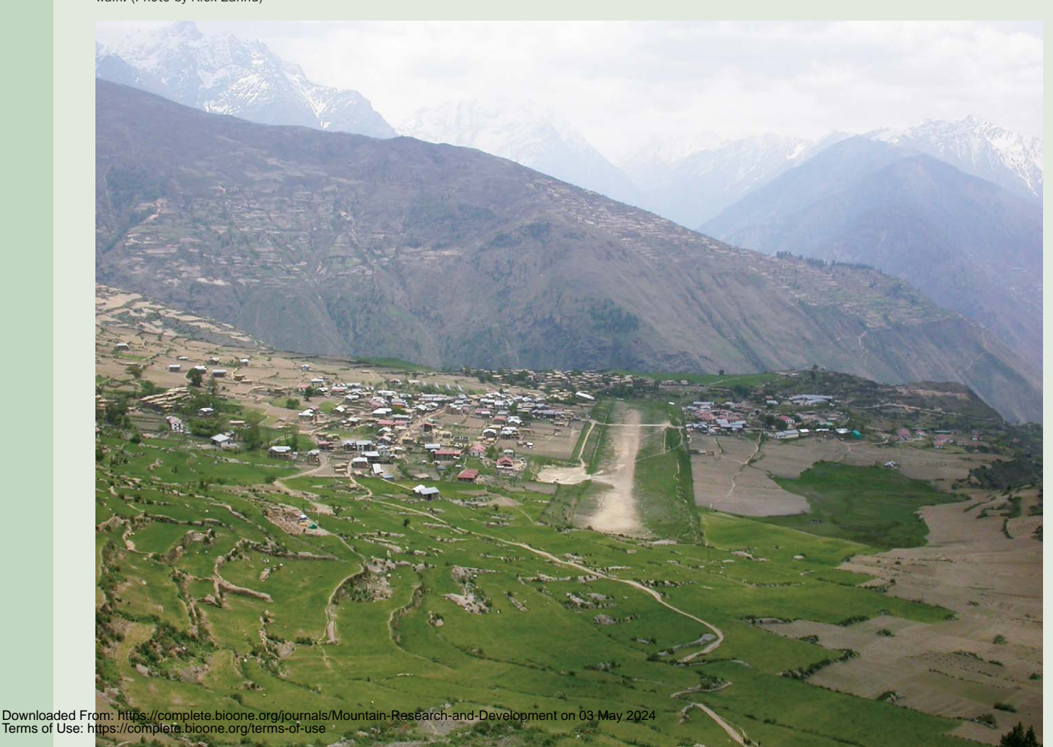
FIGURE 1 Simiko, Humla District Headquarters; the project site is within a 1-day walk.

the produce of their own land and herds have been described as "risk-averse" and culturally "conservative," and as preferring not to adopt new technologies and farming or husbandry methods that might negatively impact their ability to make it through the next dry or cold season. We have been living and working with agropas-