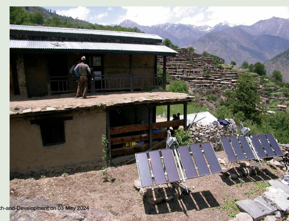
FIGURE 4 Photovoltaic panels for solar energy close to a village in the project area.

Informed by this understanding, we analyzed our cultural, socioeconomic, and attitudinal data from the baseline studies we conducted in a village prior to enter-