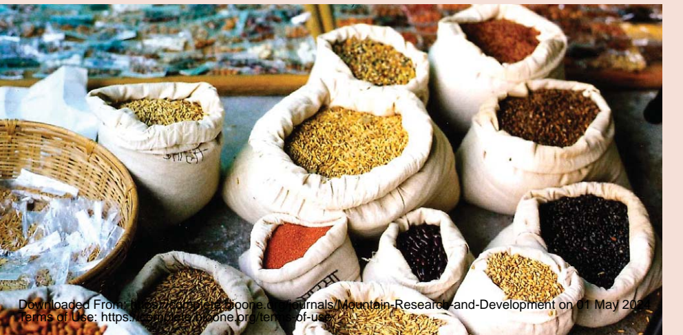
FIGURE 3 Beej Bachao Andolan helps conserve the vast crop diversity of the region.

Besides these environmental impacts, the introduction of the monetized economy had a dramatic effect on relationships. Marked social differentiation emerged based on monetary values, as the basis of existence moved from food to financial security, from community cohesiveness to individual self-interest. Even borrowing oxen from a neighbor-essential for plowing-now had to be paid for. On the prized irrigated valley floor, families began to hire out land for commercial farming. Rice and wheat began to be replaced by soybean and tomato, grown with pesticides and synthetic fertilizers. By 2007, farming by Jardhar villagers had shrunk to half of what it was just 30 years before, especially the more labor-intensive kind practiced in the rainfed homestead gardens that produced a diverse range of food crops.