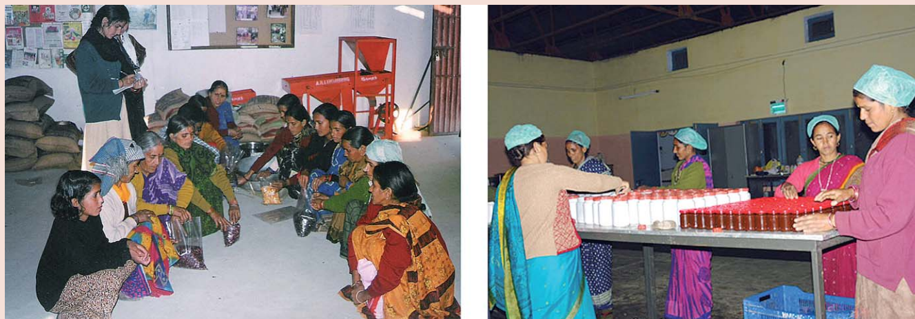
FIGURE 3 Left: members of the Rawain Women's Cooperative Federation providing advanced training on grading, packing, and processing to self-help groups. Right: members of the RWCF packing apple jam and amla pickles for marketing.

tems. Women of different SHGs were willing to take up entrepreneurship but initially were not confident of their ability to do so. An NGO working in this area, the Himalayan Action Research Centre (HARC), played an important role by providing institutional support through different programs such as creation of self-help groups (SHGs). The Rawain Women's Cooperative Federation (RWCF) was formed by HARC in the late 1990s.