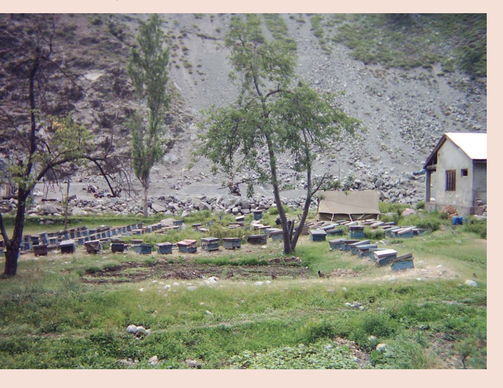
FIGURE 3 Honeybee keeping in Kalam, a common source of income in the study area. In most cases farmers place hives close to fields and pesticides heavily affect the bees.