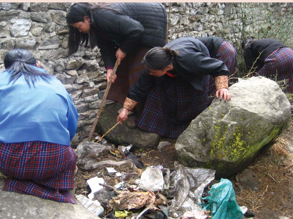
FIGURE 4 The proposed waste collection system could complement already ongoing efforts in garbage management: school girls at garbage cleanup day in Haa town.

Building on fluorescent bulb re-collection systems already in existence in the United States, through local governments and retail stores, a depot collection system is proposed for used fluorescent tube lights. While Bhutan and other mountainous developing countries lack the ease of road transport available in the US, it should be possible for them to benefit from similar collection systems, utilizing existing road and track networks, and local government infrastructure. A series of nested collection sites or depots is proposed: spent lights would be collected first at the village level, then at the county or geog level, then at the district or dzongkhag level, and finally transported to the capital, where the lights could be disposed of according to Bhutanese hazardous waste regulations, currently in development. Because the legal framework for handling hazardous and e-waste is yet to be finalized, transporting waste to Thimphu, the capital, will mean sending it to the landfill, in the short term. However, the Waste Management Act, expected to be enacted by the next session of Parliament, will provide more explicit legal guidance on the handling of hazardous and e-wastes.