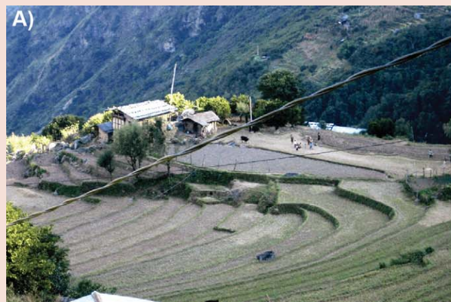
FIGURES 1A AND 1B A) Electrical lines in the foreground—a sign of ongoing rural development in Bhutan: they bring light and telecommunication to Tomijangsa, a village in Trashi Yangtse, eastern Bhutan. B) By contrast: a traditional, non-electrified kitchen in Zhemgang.

Tourism has played a key role in the economic development of Bhutan. Drawn by vast forests, rich biodiversity, and Tibetan Buddhist culture, foreign tourists pay more than US$ 200 per day to visit Bhutan, a destination in the Himalayas known for its environmental quality. More than 17,000 tourists—one for every 37 Bhutanese—visited Bhutan in 2006, providing nearly US$ 24 million in revenue. Having heard that plastic bags are banned in Bhutan, that smoking is not allowed and that 72% of the land remains under