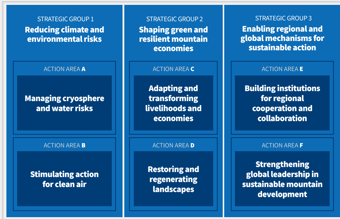
FIGURE 2 ICIMOD's 3 strategic groups and 6 action areas.