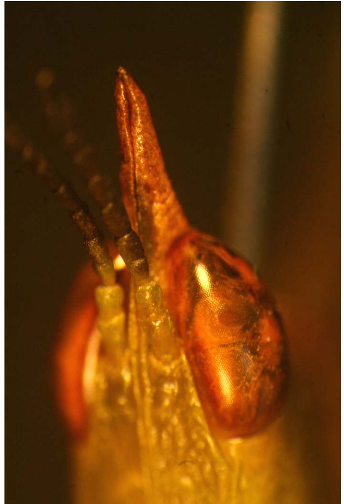
Fig. 2. Dorsal view on part of face and elongate sulcate fastigium verticis of male Plagiotriptus discolor n. sp. For color version, see Plate VI.

Co-occurring Saltatoria species. — Rhainopomma montanum (Kevan, 1950), Parasphena teitensis Kevan, 1948, Aerotegmina sp., Melanoscirtes taitensis Hemp, 2010, Ixalidium haematocelis Gerstaecker, 1869, and Gymnobothroides pullus montanus (Kevan, 1950).