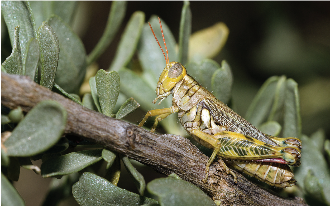
Fig. 1. Adult female Aeoloplides tenuipennis on fourwing saltbush, San Pedro Riparian National Conservation Area. Photographed 8 September 2015. (Photo Robert A. Behrstock/Naturewide Images).

basin surrounded by farmland and Chihuahuan Desert scrub/Desert grassland, receives ca 330 mm (13 in.) of rainfall/year (WeatherDB 2015) and collects runoff and sediments from surrounding North-South oriented mountain ranges. Alluvial soils adjacent to managed wetlands support extensive stands of fourwing saltbush. Other shrubs at the collecting site were a few small mesquites. Ground cover included plains bristlegrass, Setaria macrostachya (Poaceae), peppergrass, prickly Russian thistle, Coulter's horseweed, golden crownbeard, hairyseed bahia, Bahia absinthifolia (Asteraceae), burroweed, Isocoma tenuisecta (Asteraceae), silverleaf nightshade, copper globemallow, and trailing windmills. Specimens were collected by shaking foliage over the mouth of an insect net. The area sampled was ca 20 × 30 m and included both individual plants and clumps of fourwing saltbush. All visits to Whitewater Draw were made during mid-morning to mid-day and temperatures were ca 32°C (90°F).