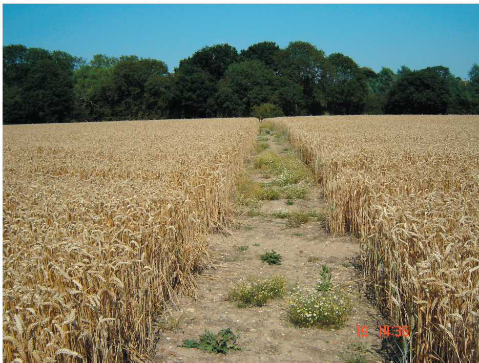
Fig. 1. Crossfield footpath (note the sporadic patches of vegetation). See also PLATE I.

*** grass margins established under the Entry Level Stewardship (ELS) scheme to promote biodiversity on farmland