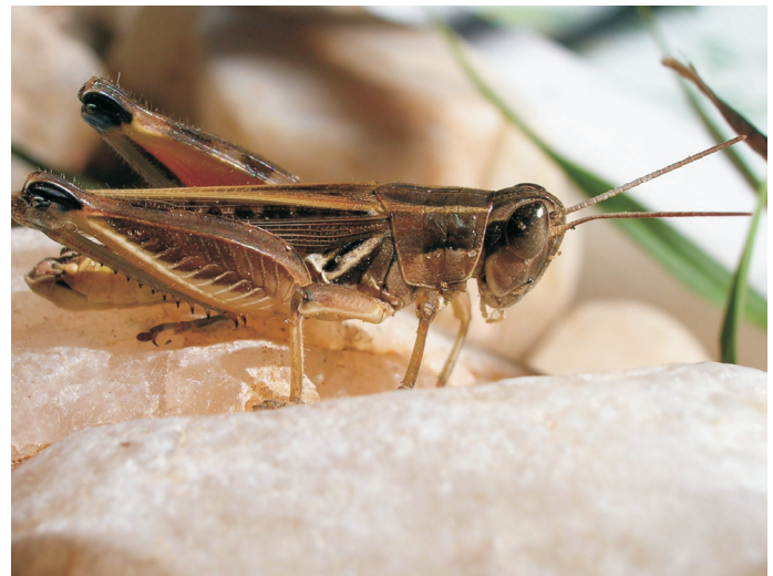
Fig. 3. Dichroplus pratensis male, as Fig. 2. See Plate IV.