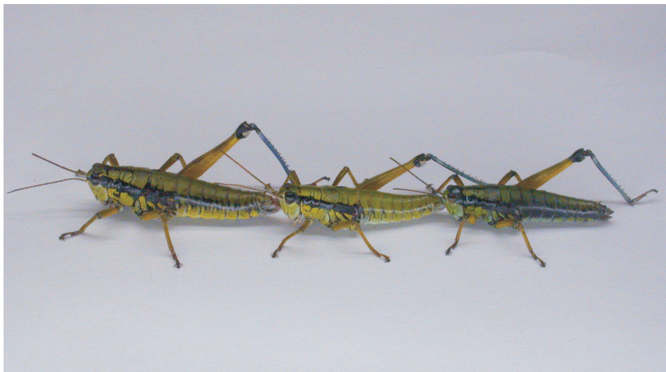
Fig. 3. Podisma sapporensis females from the three populations illustrating size differences; left to right from Akan, from Shimokawa and from Teine. See Plate II.