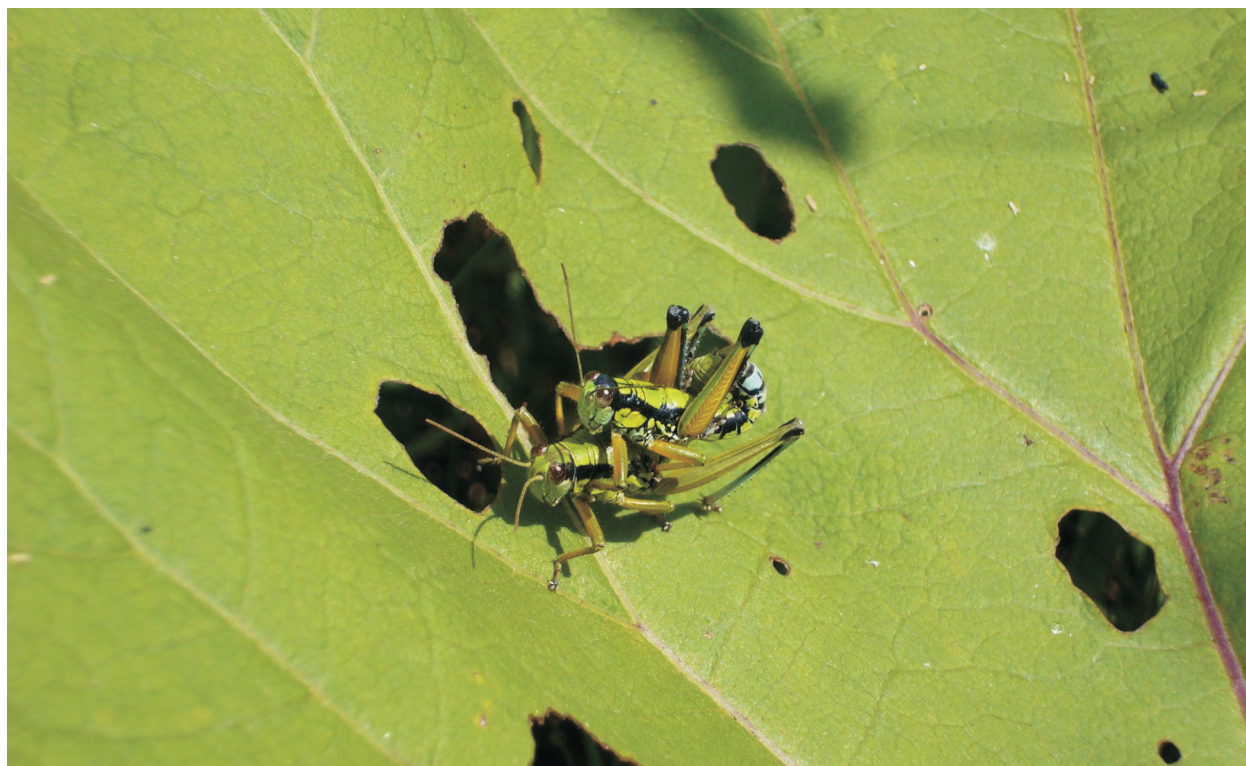
Fig. 2. Podisma sapporensis mating pair, Teine population, Hokkaido Japan. See Plate II.