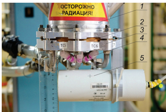
FIG. 2. Experimental setup equipment. 1. Lithium target assembly. 2. Copper substrate. 3. Aluminum disc. 4. Cells in flasks. 5. Gamma-ray dosimeter. The inscription in Russian («осторожно радиация!») translates as “caution radiation”.