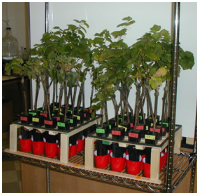
Figure 2. Transmission experiment plant arrangement. Note: a large rectangular cage was placed around the plants when insects were introduced.

When H. coagulata were initially exposed to a control plant under laboratory conditions, they usually established contact within 10 min followed by probing. H. coagulata exposed to plants treated with either dose of pymetrozine were much more agitated than insects exposed to control plants. While 94% of H. coagulata exposed to control plants established contact with the test plant for at least 10 min per hour, 81% of H. coagulata exposed to test plants receiving 0.0075 mg of pymetrozine per plant and 38% of H. coagulata exposed to test plants receiving 0.015 mg of pymetrozine per plant established contact (Table 1) (see video). Percent contact in all groups of H. coagulata was statistically different among treatments ( p < 0.001 ). The percentage of H. coagulata establishing contact with the host plants varied little over a 24 h period; however, differences among treatment groups were evident (Fig. 3). More than 90% of the control insects established contact with the plant.