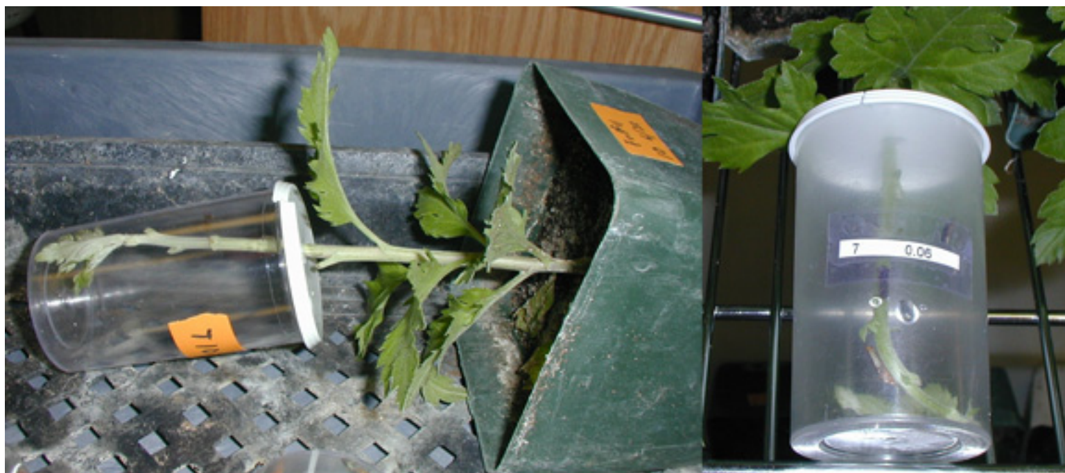
Figure 1. Homalodisca coagulata excreta study setup.

the humid box for 2 hours at 25° C. The plate was washed 6 times before adding 100 µl of o-Phenylenediamine solution per well and incubated for 15–30 minutes. The reaction was stopped by adding 50 µl of 3M sulfuric acid to each well. Results were evaluated by examining the wells using a Benchmark microplate reader (BioRad, www.bio-rad.com ) and analyzed using the BioRad Microplate Manager V. 5.1 build 75 software. Wells in which color developed to greater than twice the OD 490 of the negative control were considered positive. Test results were valid only if positive control wells tested positive and negative control buffer wells remained clear. Data were pooled between replications because no significant differences between dates were noted. Differences in rates of X. fastidiosa infections in grapevines receiving different doses were compared using ANOVA and LSD ( p = 0.001 ).