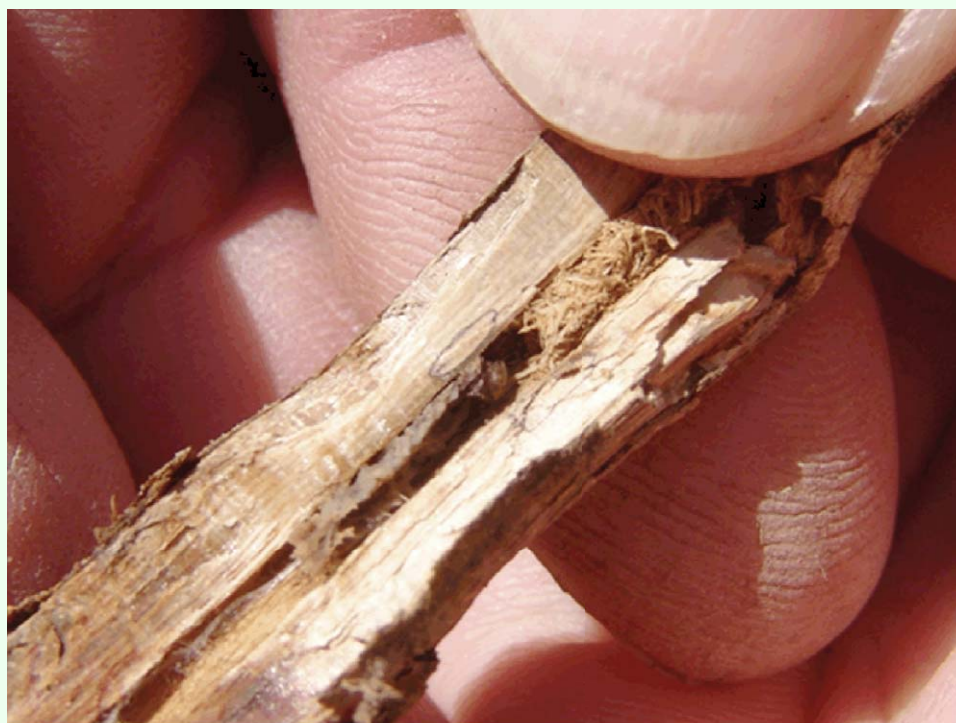
Figure 1. D. texanus tunneled soybean stem, frass plug present with a dead larva. High quality figures are available online.

Forty-five fields planted to soybeans in 2007