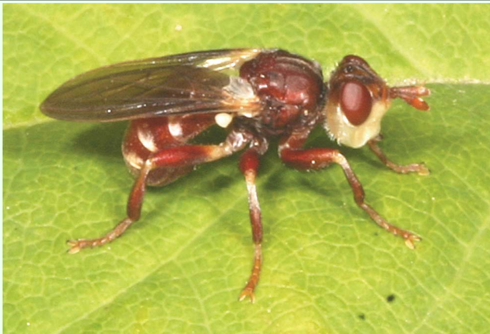
Figure 4. Myopa clausa : a hilltopping species of Conopidae found on Mount Rigaud, Quebec. High quality figures are available online.

Waiting D. aculeata males (Figure 5) were extremely alert, often adjusting their position on the perch or moving from one perch to another nearby at irregular intervals. It was possible to see their heads frequently tilting to follow the flight of insects, passing by within a distance of about 20–30 cm. Males alternated periods of perching with brief patrolling flights about the bush in which the perch was located, at a distance of a few centimeters from the bush itself. Some of these patrolling flights, however, were much longer with the insect leaving the bush to an unknown location. Sometimes such reconnaissance flights appeared spontaneous, but often they were triggered by the approach of a flying, similar-sized insect (e.g., tachinid fly or small bee). In such a case, the conopid would suddenly follow and closely inspect the insect, returning soon after to the bush.