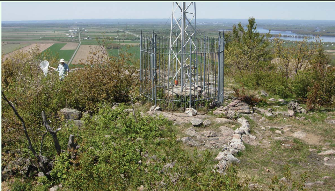
Figure 2. Summit of Mount Rigaud (Quebec, Canada 45° 27' 59" N, 74° 19' 35" W), looking toward the northwest. High quality figures are available online.

All data from Conopidae collected within 120 km of Ottawa, ON, Canada and represented in the Canadian National Collection of Insects, Arachnids and Nematodes are summarized. Ottawa was chosen as a focal point because three hilltops in the vicinity have received annual collecting attention since 1961. The hilltops involved are King Mountain, QC (49° 29' 20" N, 75° 51' 45" W), Duncan Lake vicinity, Masham, QC (45° 40' 53" N, 76° 3' 1" W) and Mount Rigaud, QC. The collections in the Museum of Zoology of the University of Rome “Sapienza” and in the Civic Museum of Zoology of Rome, were examined as well, to summarize data on any conopids collected within 1.5 km of the summit of Colle Vescovo.