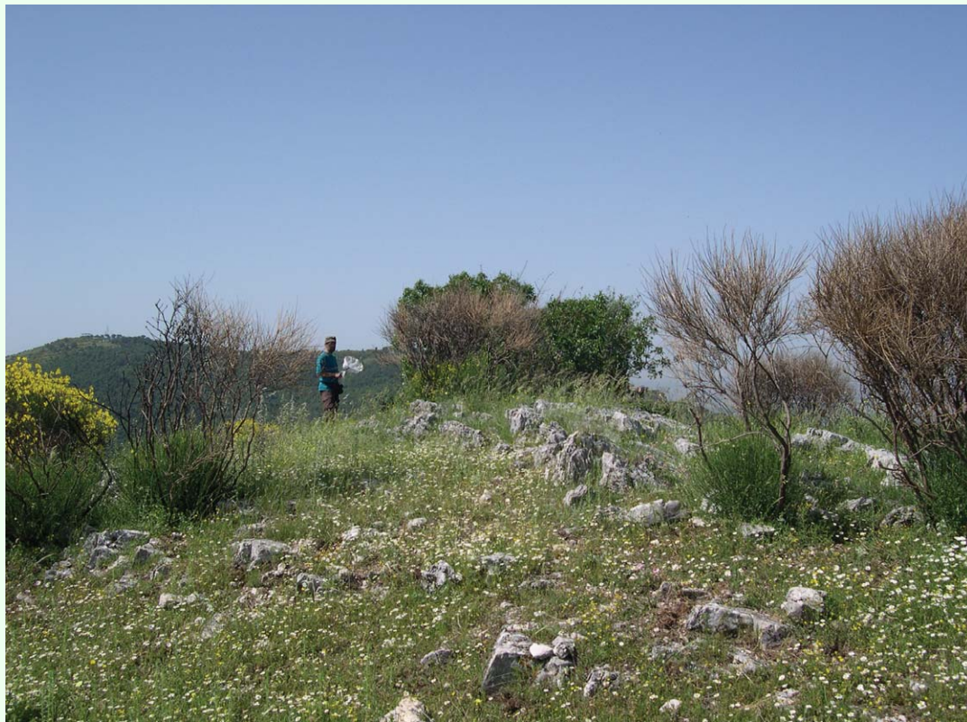
Figure 1. Colle Vescovo, (Latium, Italy, 41° 58' 39" N, 12° 48' 30" E), summit viewed from the northeast. Picture taken in late May 2008; the traces of a recent fire are still visible, and the 3 m Pistacia tree has been removed. High quality figures are available online.

None of the conopids observed on the hilltop were marked. Due to the relatively sporadic nature of their presence and to the sparse vegetation of the hilltop, however, it was often possible to record the activity of individuals without interruption for many minutes. Specimens were collected with a hand net and were deposited in the senior author's collection. Voucher specimens are in the Museum of