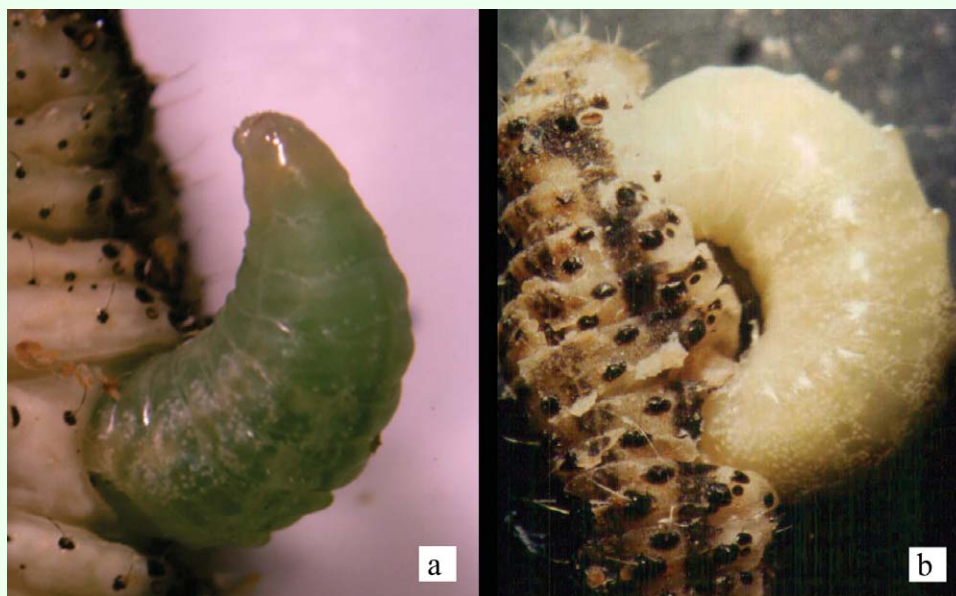
Figure 1. a) T. nigriceps larva egressing with head first through the second abdominal segment of the host. The egressing larva is light green in color. b) Egressing T. nigriceps larva reinserted its head into the posterior end of the host between the fifth and sixth abdominal segments of the host. The larva became plump, opaque, and whitish in color. High quality figures are available online.

On reaching the third larval instar in vivo , the T. nigriceps larva that is light green in color, egresses from the host (Figure 1a). Egression occurs by making a hole in the host's cuticle near the second abdominal segment on the side, big enough to first push its head out and then slowly push the anterior part of the body out of the host. As soon as the head and \frac{3}{4} of the body is out of the host, the larva curls, makes a hole in the host's cuticle, and reinserts the head into the host posterior to its emergence hole between the fifth and sixth