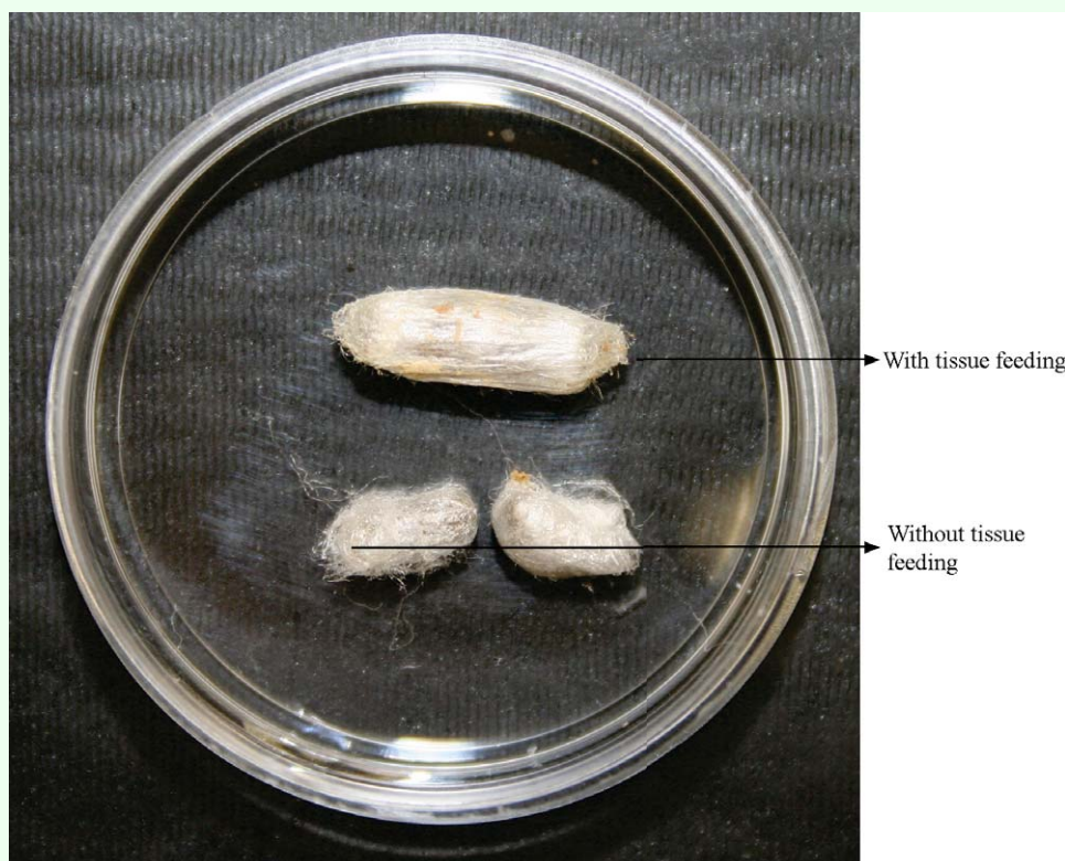
Figure 3. Comparison of the size of the cocoons from treatments with and without tissue feeding after egression. The cocoons formed from the larvae without post-egression tissue feeding were less than half the size of the cocoons formed from the larvae with post-egression tissue feeding. High quality figures are available online.

In the treatment with host tissue feeding, 80% of the adult wasps that developed were alive for more than 4 weeks as normally occurs under laboratory conditions. Only 20% of the emerged adults in treatment with restricted host tissue feeding survived for 1 week (Figure 4). There was a significant difference between these two treatments ( \chi^2 = 47.73 ; df = 1 ; and p < 0.0001 ).