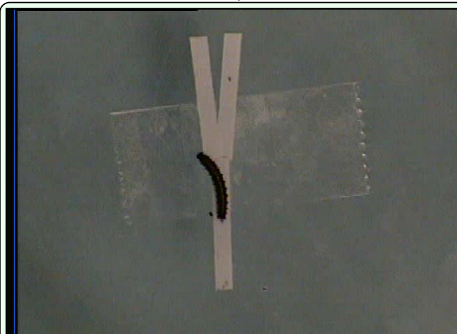
Video 1. Y constructed from sections of a paper strip over which caterpillars of Dione juno huascuma had previously walked (stem and right arm). A strip not previously walked on by caterpillars (blank) forms the left arm. The response of a caterpillar allowed to choose between the arms is shown. Click image to view video. Download video

each trial to preclude a positional bias. Maze sections and experimental caterpillars were used only once.