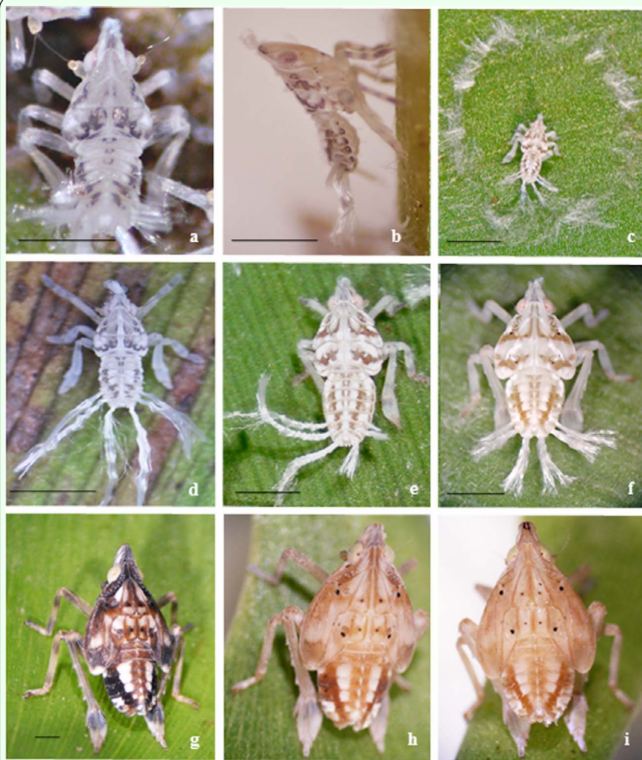
Figure 1. Nymphal instars of Taosa ( C. ) longula . (a) first instar, dorsal; (b) first instar, lateral; (c) second instar in the waxy hair circle; (d) second instar; (e) third instar; (f) fourth instar; (g, h, i) fifth instar, different tones. Scale bar: 1 mm. High quality figures are available online.