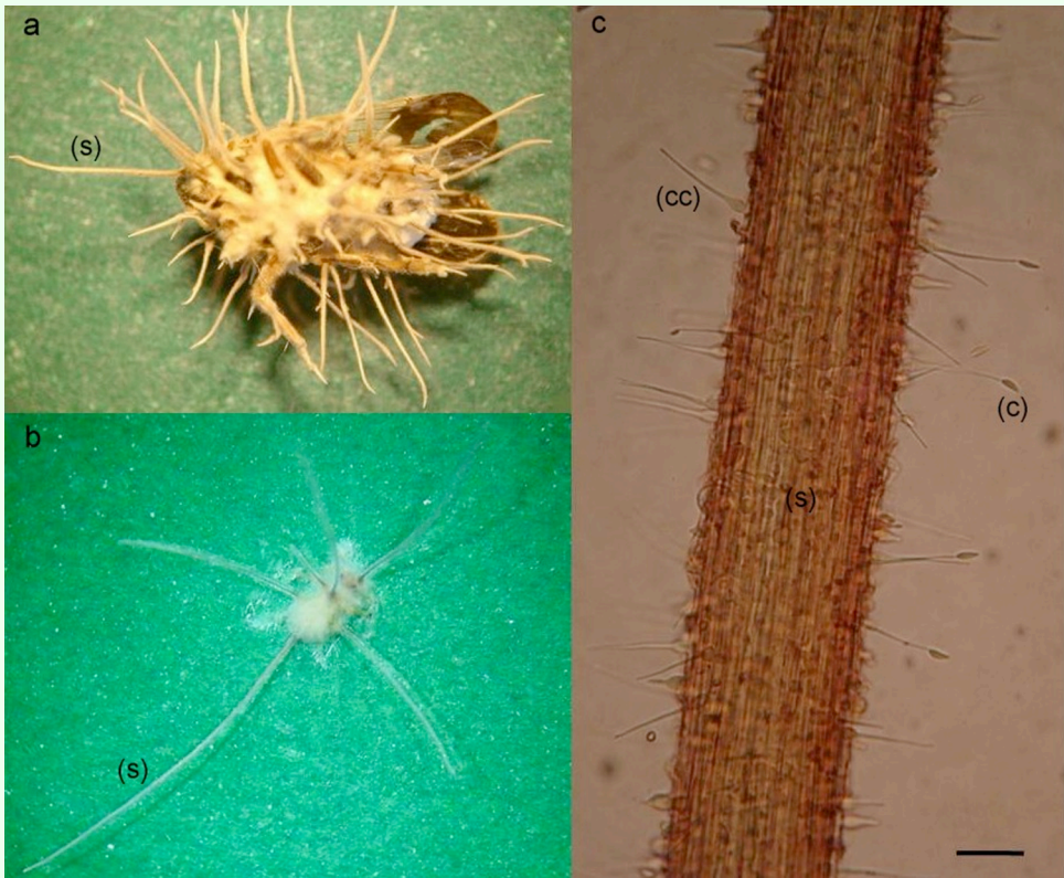
Figure 1. a: Adult Oliarus dimidiatus infected with Hirsutella sp. ARSEF8378. Note the formation of synnemata (s) branched with short lateral branches. b: Nymph of Ectopsocus sp. infected with Hirsutella sp. ARSEF8679. Note the synnemata (s) is slender and simple. c: Conidiogenous cells (cc) and (c) conidia of Hirsutella sp. ARSEF8679 arising as lateral cells over the whole length of the synnema (s). Scale bar: a: 2.5mm, b: 2mm, c: 17µm. High quality figures are available online.