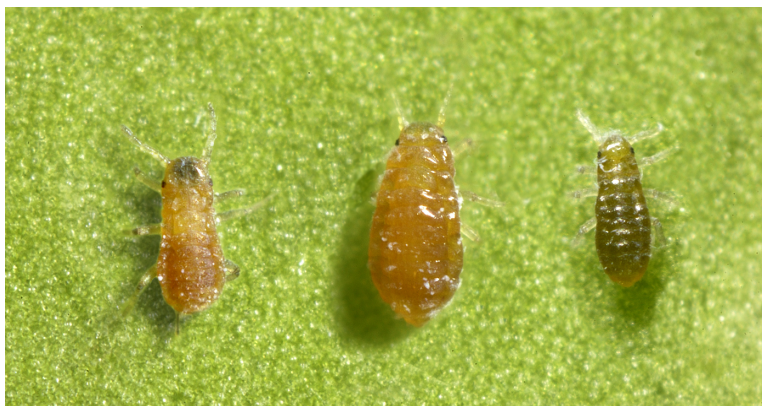
Figure 3. Progeny of an alate Woolly apple aphid. First instar apterous virginoparae (left), oviparous female carrying a single egg (middle) and male (right).

Since some alates produced young virginoparae before producing sexual morphs, both asexual and sexual reproduction may happen on the new host. Although sexual morphs may not be able to feed on the new host, oviparous females lay eggs, which develop into young virginoparae. It may be that alates from aphid colonies can spread long distances between apple trees, however, nothing has been published on the migratory behavior of alates. From our findings we suggest that they could have a considerable impact on spreading infestation among apple trees. Further research is required on the dispersal behavior of alate aphids and any other alternative host plants under different environmental conditions in New Zealand.