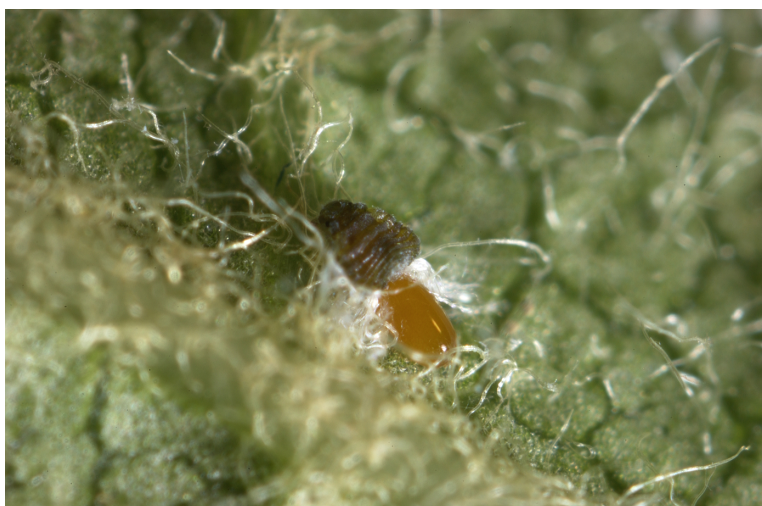
Figure 4. Woolly apple aphid oviparous female; laying an egg on the abaxial surface of an apple leaf.

reported by others: Baker (1915) 0.64 mm x 0.288 mm; Monzen (1925) 0.55mm x 0.35 mm; Asante (1994) 0.58 \pm 0.01 mm x 0.33 \pm 0.01 mm wide. Eggs are mostly laid on the abaxial surface of apple leaves and occasionally are found covered with wool secreted by the oviparous female. The female dies soon after laying the egg. More sexual morphs and eggs were found on leaves collected from apple trees grown in the glasshouse ( 7.6 \pm 0.93 sexual morphs and 3.5 \pm 0.60 eggs per tree) than from the trees grown outside ( 1.0 \pm 0.39 sexual morphs and 1.3 \pm 0.34 eggs per tree). In addition, more alates were seen on the leaves collected from the glasshouse.