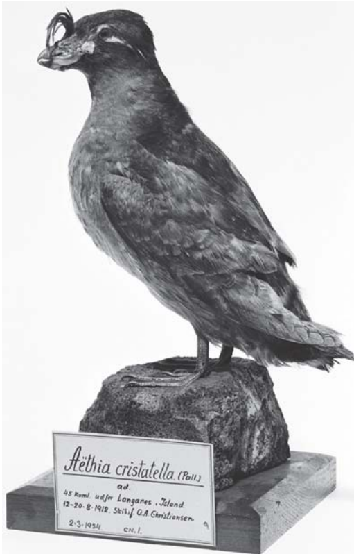
Figure 1. Crested Auklet (ZM 2.3.1934. C.N.1) taken northwest of Iceland between 12 and 20 August 1912. Note the worn primaries.

mm long, within the range of adults breeding in the northern Bering Sea but longer than in subadults (Table 1 in Bédard and Sealy 1984: 464). The bill was black with a hint of pale orange on the mandible, typical of SY adults in late fall of their second year after hatching (Jones 1993a; Pyle 2009). This bird's ornamental plumes had developed during the prebasic molt, in the definitive cycle that is equated to twelve months of age or older (Pyle 2009). A male (UWBM 51224) taken at sea off Unimak Island, Aleutian Islands on 2 March 1992, was of comparable age (SY) and plumage, except with slightly more orange visible on the bill, as expected closer to the breeding season (Table 1).