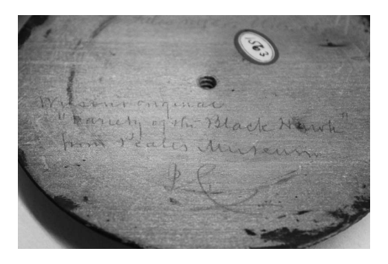
Figure 4. Bottom of the wooden base (socle) of ANSP 1563, which bears an inscription by John Cassin ("JC") that identifies the specimen as " Falco niger Wils. vol. [6] / Wilson's original / "variety of the Black Hawk" / from Peale's Museum / JC."

specimen is 208 yr old and most likely arrived at the ANSP with the other 2 Wilson types (ANSP 2032 and ANSP 1551), during Cassin's long tenure as curator.