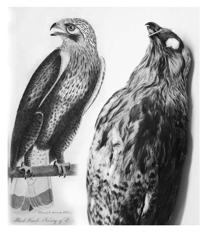
Figure 3. (left) Alexander Wilson's published image of the "Variety of [Black Hawk]" in American Ornithology (1812, Pl. 53). (right) Digital photograph of ANSP 1563, which served as the model for Wilson's drawing and was deposited by him in the Peale Museum in January 1812 (Peale Museum No. 405).

"no numbers ... on the specimens to fix their identity" (ANSP Archives, coll. 54, box. 4). Ten years later, by which time the modern ANSP numbering system had been implemented, Stone (1899) published a catalog of type specimens in the ANSP collection, in which he explained: "The collections [of the Peale Museum] were dispersed at auction upon the breaking up of the museum and such Wilson specimens as may have been there are probably lost. Two of the types [i.e., Broad-winged Hawk and Mississippi Kite] were, however, obtained in exchange by the Academy before the Peale collection was scattered" (Stone 1899:11). Stone (1915:512) later wrote that, along with the 2 specimens at ANSP and a third at Vassar College (see below), "[the MCZ specimens without data] probably comprise all that are extant