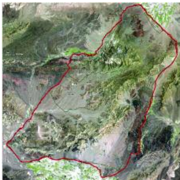
FIG. 45. Map showing zone of Khabr National Park

from Sistan va Balouchestan and Lorestan provinces (Brandt 1941).