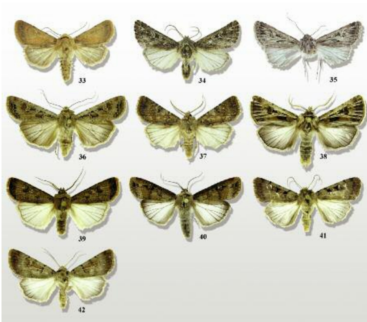
FIGS 33-42: Adults, 33. Dichagyris amoena 34. Dichagyris eureteocles 35. Yigoga truculenta toxistigma 36. Euxoa conspicua 37. Euxoa canariensis diamondi 38. Agrotis obesa scythia 39. Agrotis segetum 40. Agrotis ipsilon 41. Eugnorisma chaldaica 42. Eugnorisma insignata (above)