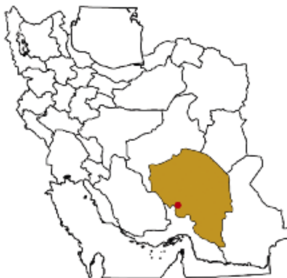
FIG. 46. Map showing position of KNP in Kerman province, Iran

Bionomics: univoltine, adults come to artificial light and are on wing in June. Early stages and food plants are still unknown.