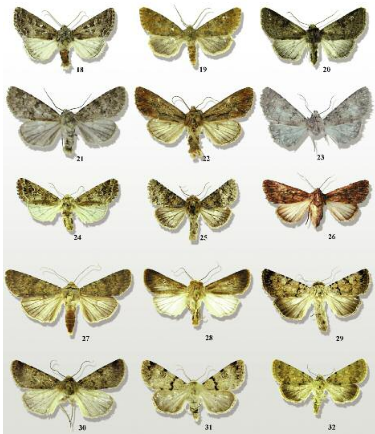
FIGS 18-32: Adults, 18. Phoebophilus veteriosa 19. Boursinia oxygramma 20. Maraschia grisea 21. Polymixis zagrobia 22. Polymixis crinomima 23. Polymixis apothaina laristana 24. Saragossa siccanorum poecilographa 25. Hecatera dysodea 26. Leucania herrichii 27. Parexarnis damnata 28. Dichagyris elbursica 29. Dichagyris tyrannus beluchus 30. Dichagyris argentea darius 31. Dichagyris singularis 32. Dichagyris forficula