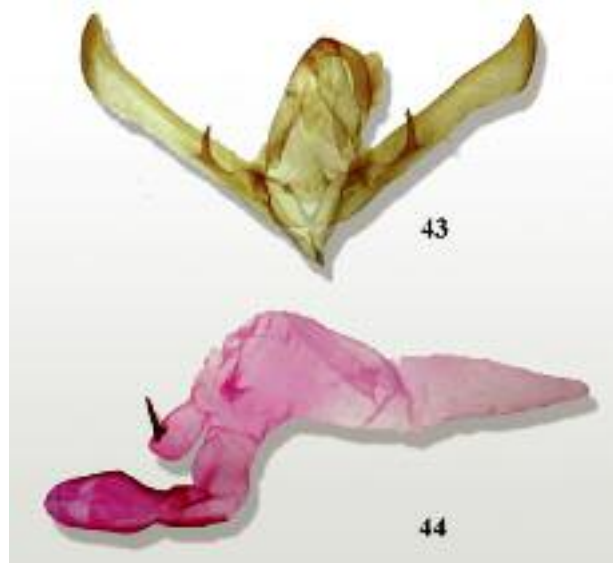
FIGS 43-44: Male Genitalia of Cucullia cineracea argyllacea slide no. AS428m, 43. Armature 44. Aedeagus and vesica. (right)