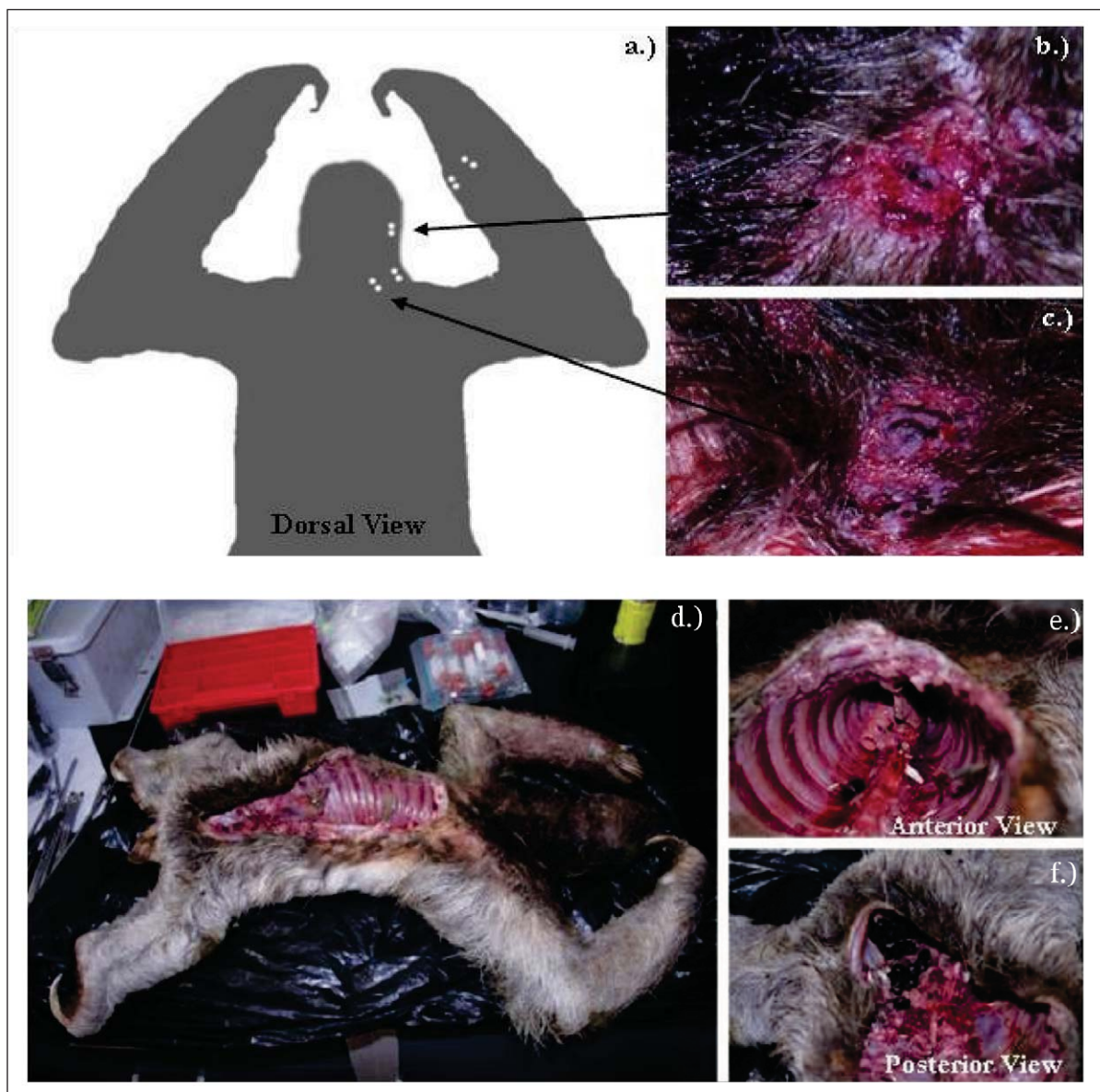
Figure 2. Diagram and photographs of freshly killed sloth. (a) Locations of five paired puncture wounds. (b) Close up views of punctures to side of the head and (c) the trapezius region of the back. (d) Ventral view of the cleanly disemboweled sloth carcass. (e) Close up view of the pericardial cavity and cleanly cut trachea, and (f) posterior view showing sloth feces in the rectum.

Sloths have not been reported in the diet of owls, but are commonly eaten by medium-sized and large felids (Sunkist and Sunkist, 2002; Moreno et al. , 2006) and eagles (Fowler and Cope, 1964; Galetti and Carvalho, 2000; Touchton et al. , 2002). We are fairly confident that the predator was not a harpy eagle ( Harpia harpyja ), as they were not known from BCI at the time, do not hunt in the