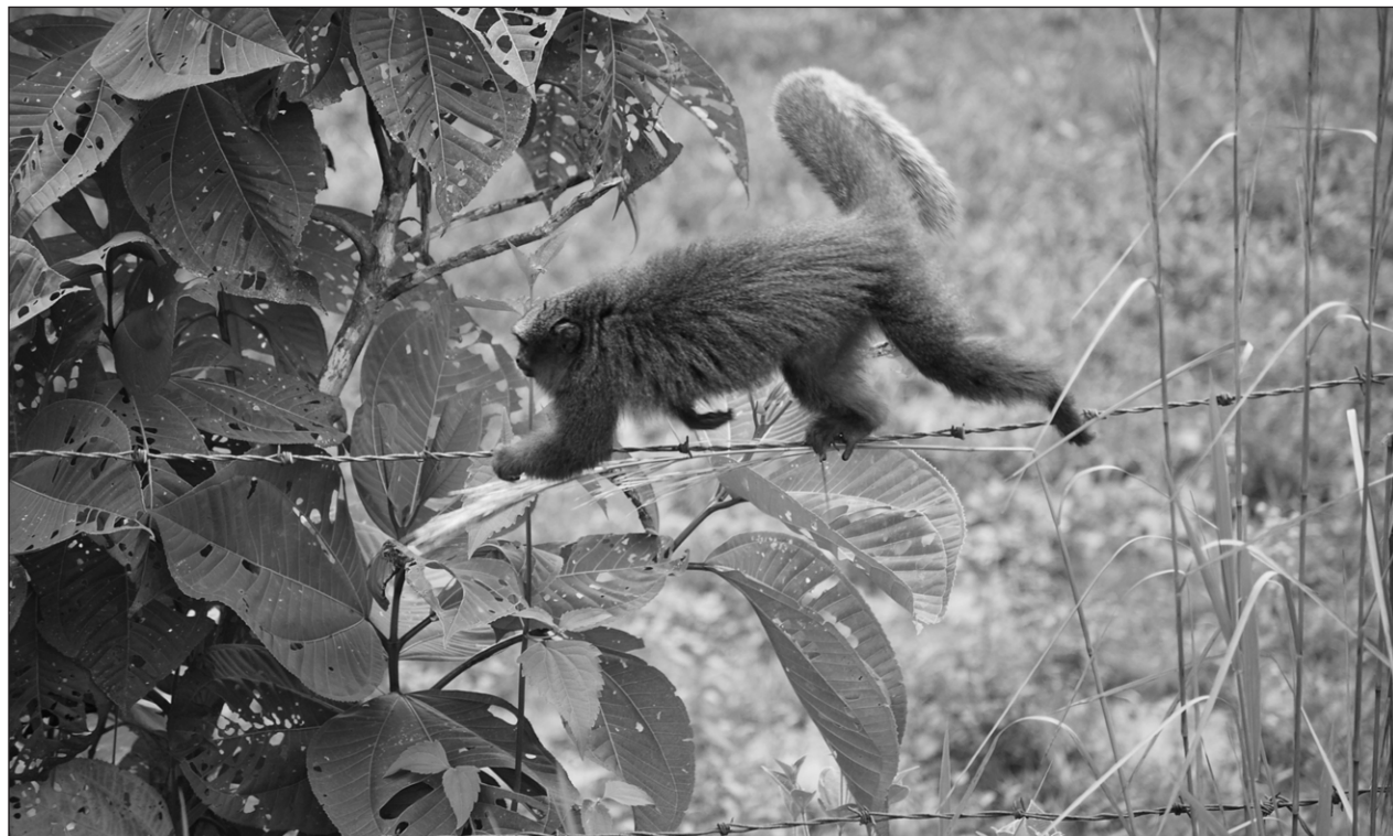
Figure 5. Callicebus caquetensis negotiating barbed wire fence between two fragments.

Herbicide is known to affect aquatic habitats and to cause malformation of tadpoles (Giesy, 2000; Chivian & Bernstein, 2008). Continuing fumigation of illegal crops with glyphosate causes environmental pollution and has never