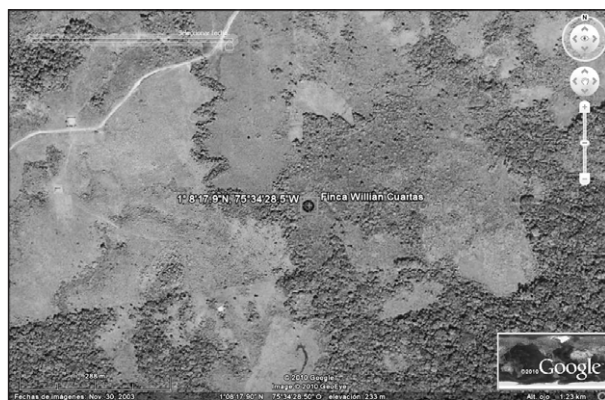
Figure 3. Area around the Hacienda William Cuatras (4 km × 2.75 km) showing ongoing fragmentation.

extremely fragmented. Local people confirm that C. caquetensis eats Mauritia flexuosa fruits, just as has been observed for Callicebus torquatus lugens by Palacios et al. (1997) and Callicebus t. lucifer by TRD (unpubl. data).