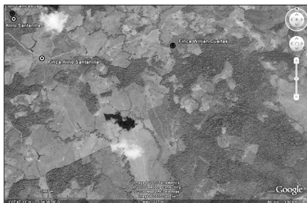
Figure 2. 75-km 2 quadrat analyzed for fragmentation and percent of forest cover.