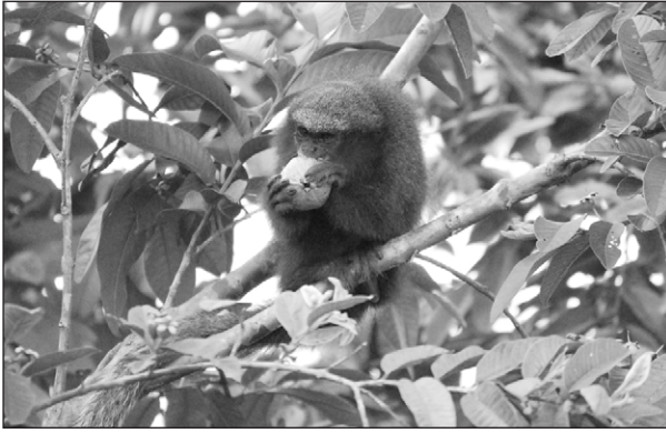
Figure 6. Callicebus caquetensis eating a guava fruit.