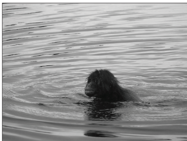
Figure 3. Locomotion of the adult female black spider monkey ( Ateles chamek ) on a submerged branch prior to climbing to tree crowns in the riparian forest of the Guaporé River in the state of Mato Grosso, Brazil.

National Park in the municipality of Santa Cruz, Bolivia (Fig. 1). Next, the specimen began to swim towards the opposite margin, located in the state of Mato Grosso, Brazil. The swimming activity lasted ca. 15 min, and the specimen crossed 38 meters from one margin to the other. The specimen had the body completely submerged, leaving only the head out of the water (Fig. 2), and moved its arms and legs. It was panting and was not scared by our boat; on the contrary, it even climbed onto the boat and walked around the boat's edge before immersing back into the water. Then, the specimen managed to climb onto a submerged branch and began a fast movement between tree crowns in the riparian forest of the Guaporé River, on the Brazilian side (Fig. 3).