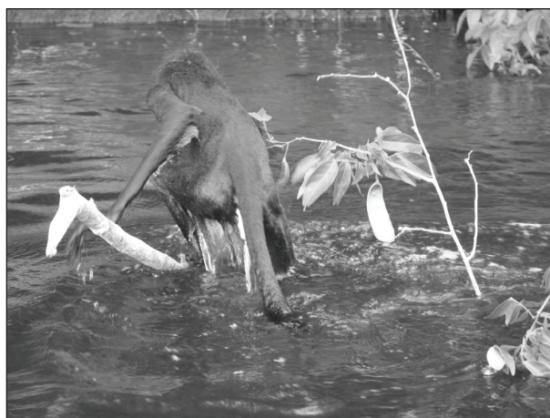
Figure 2. Photography of the adult female black spider monkey ( Ateles chamek ) swimming towards the shore of the state of Mato Grosso, Brazil.