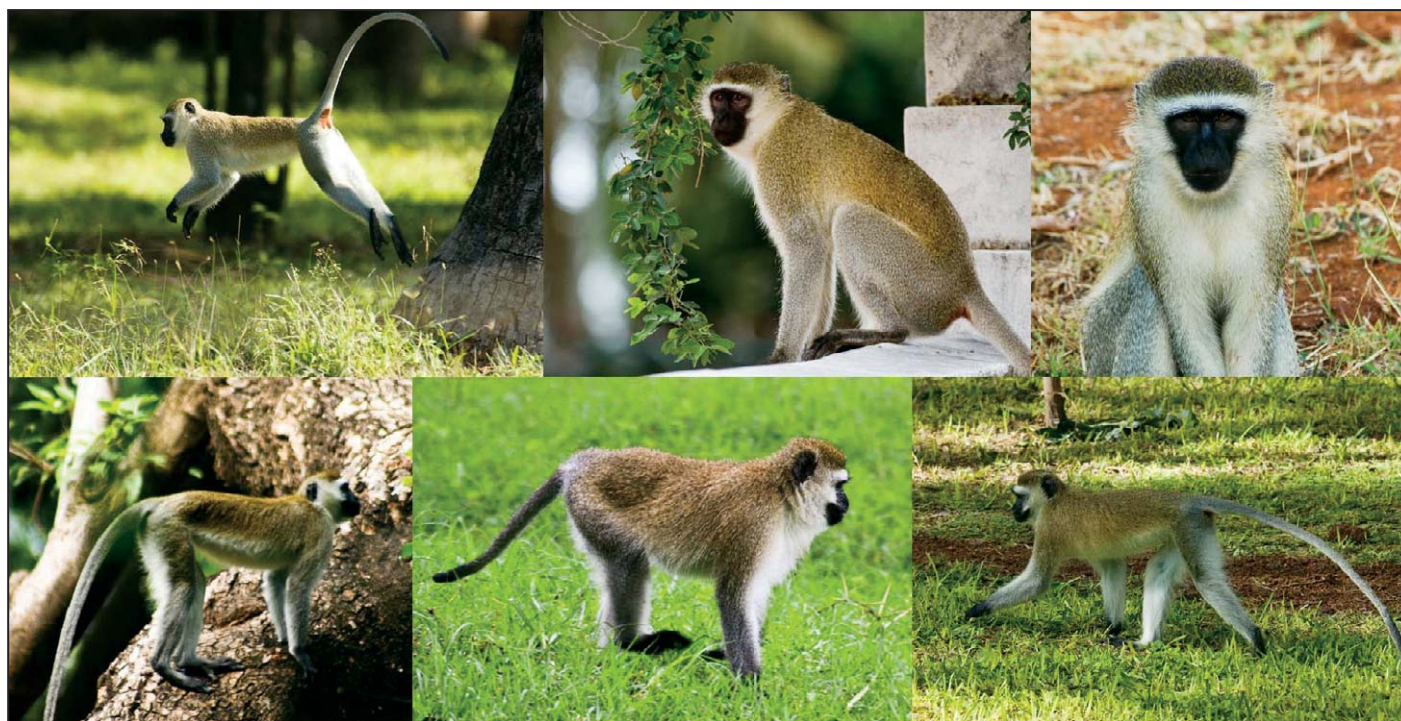
Figure 4. Chlorocebus pygerythrus 'hilgerti' adult males over the geographic range in Kenya and Tanzania surveyed during this study. Top row , left to right: Malindi, northern coast of Kenya; Majengo, north of Mombasa, southern coast of Kenya; Tanga, northern coast of Tanzania. Bottom row , left to right: South Horr, north-central Kenya; Lake Naivasha, south-central Kenya; Lake Manyara, north-central Tanzania.

We are grateful to Primate Conservation Inc., the Margot Marsh Biodiversity Foundation, the Primate Action Fund, and the Critical Ecosystem Partnership Fund at Conservation International for financial support. We acknowledge the Kenya Ministry of Education, Science & Technology (permit 13/001/33C 283) and the Tanzania Commission for Science