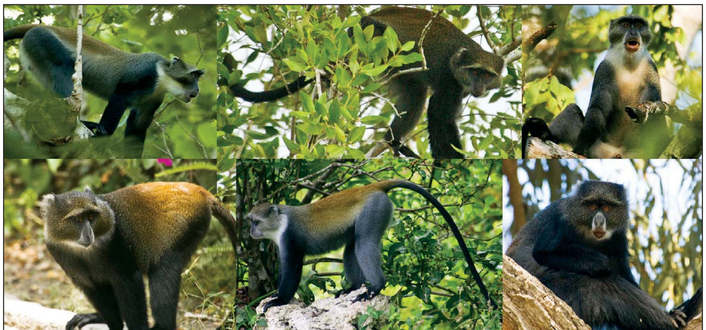
Figure 3. Cercopithecus mitis ‘ albogularis ’ adult/subadult males over the geographic range in Kenya and Tanzania surveyed during this study. Top row , left to right: Gedi Ruins, central coast of Kenya; Saadani National Park, northern coast of Tanzania; Mrima Hill, southern coast of Kenya. Bottom row , left to right: Usa River, northeastern Tanzania; Unguja Island, eastern Tanzania; Ndarakwai, northeastern Tanzania.

Some geographic variation among adult and subadult male C. p. ‘hilgerti’ is, however, present, particularly in (1) the intensity of pelage color, (2) the length of the whiskers,